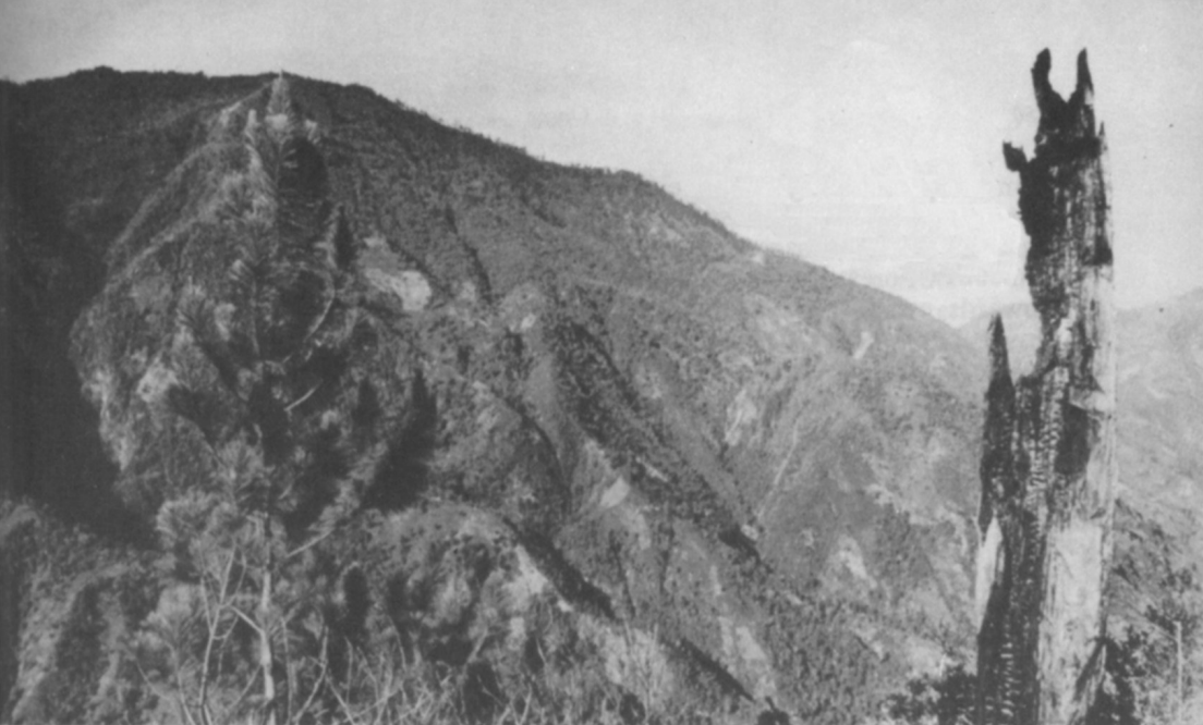
PIC MACAYA, 2347m, the north face, showing how the forest had been burned and cut almost to the summit in 1975.

limestone deposits and are barely suitable for agriculture. There are few extensive areas of suitable habitat for hutias left anywhere in Haiti, even in the remote Massif de la Hotte area of the far south. The problem is aggravated because hutia's breed only once each year. The gestation period is between 125 and 150 days, and all but one of the known births produced only a single young. The exception was a case of twins from a colony at the US National Zoological Park (Eisenberg, pers. comm.)