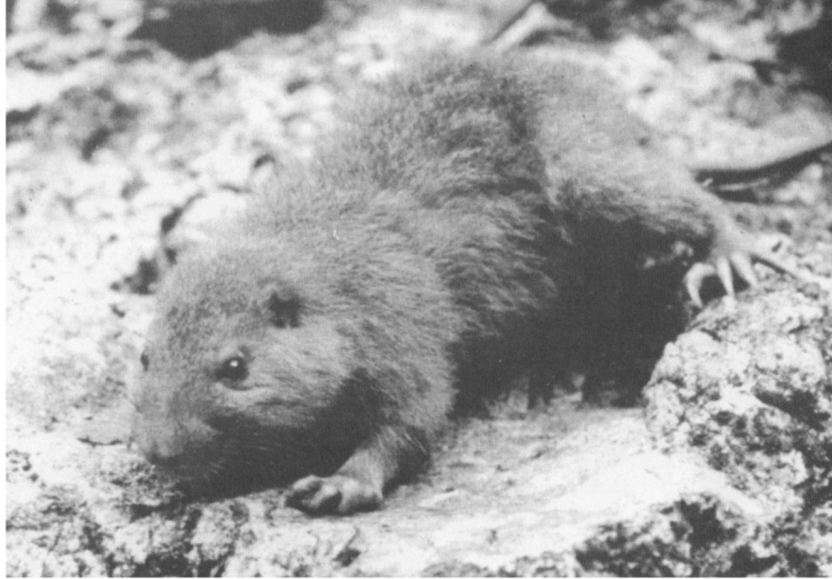
HUTIA caught in southern Haiti

south-western Haiti near Duchity, Jérémie and Miragoane. A professional hutia hunter from near Sabana de la Mar reported that hutias were good climbers and made dens in cavities of large partially decayed trees; they have at least two holes in each tree and travel through the trees rather than come to the ground. The captive animals were collected by climbing trees and taking them from sleeping chambers (Clayton Ray, personal communication, based on conversations in 1958 with the animal collector). This apparent discrepancy may indicate that different behavioural characteristics are preserved in diverse populations of Plagiodontia .