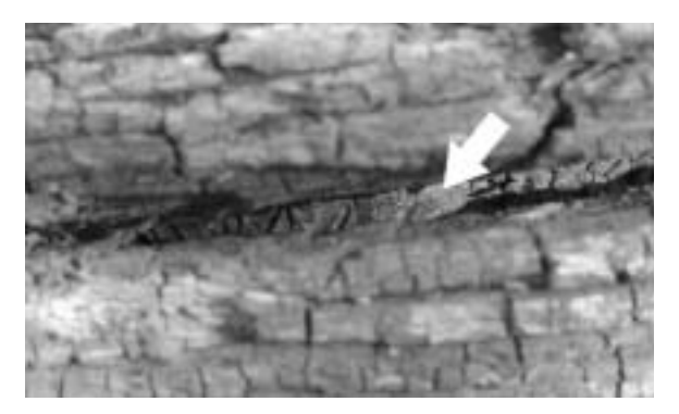
Hatchling Cyclura ricordii hiding inside a hollow log.

fringes of Los Olivares and in many other smaller fondos. In fact, almost any suitable spot seemed to serve as a nesting site. Small fondos of only 1 m<sup>2</sup> contained finished nests. We even found evidence of nesting attempts and a few finished nests in some patches of cascajo.