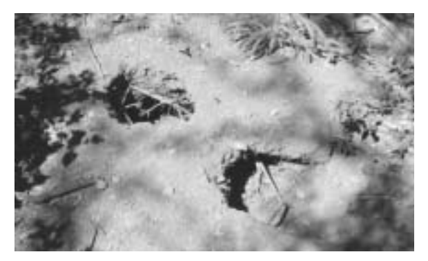
Effects of nest trampling by cattle.

Cyclura ricordii may have a competitive advantage for reproduction in this fondo.