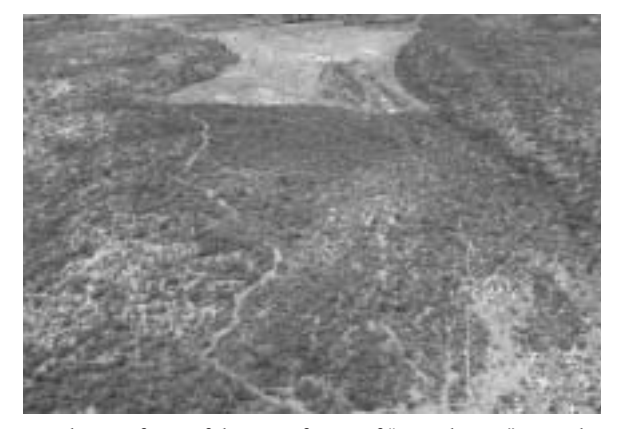
Aerial view of part of the outer fringes of "Los Olivares." Note the recent clearing of land in the upper center of the photo and the clearing, which is taking place in the lower right corner.