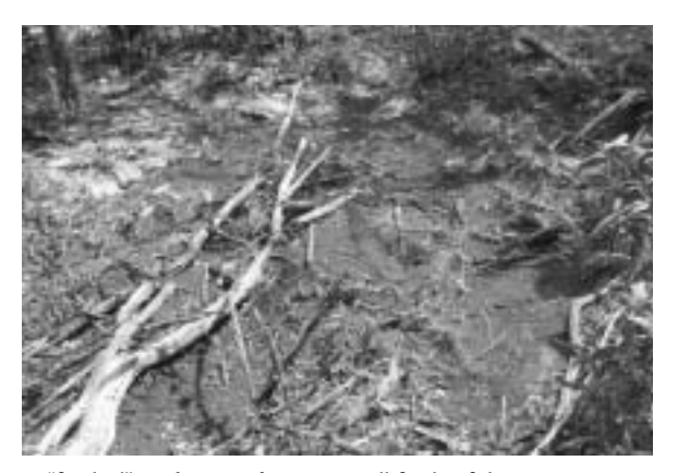
A "finished" Cyclura ricordii nest in small fondo of about 1.5 x 1.5 m.