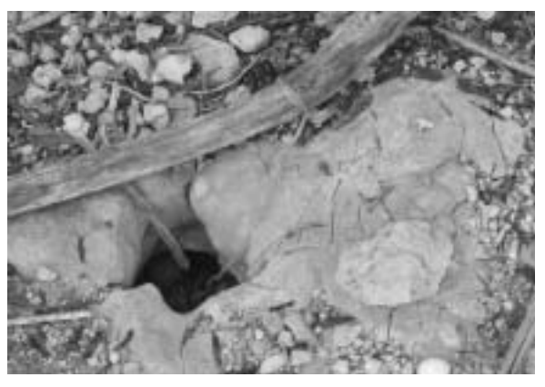
A snare trap used by local inhabitants to catch iguanas.