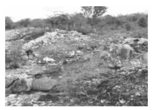
Waste dump in the outskirts of Pedernales; Cyclura ricordii is known to occur in the area in the background.