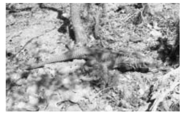
A gravid female Cyclura ricordii on múcara (limestone outcrops).

area "Ti Conserva" west of Tru Nicolá, (6) the area southeast of El Cerro, (7) "Cayo de las Iguanas" y "Cayo del Pey" in the Laguna de Oviedo, and (8) the western coast of the Laguna, directly opposite to the mentioned keys. We found signs of C .