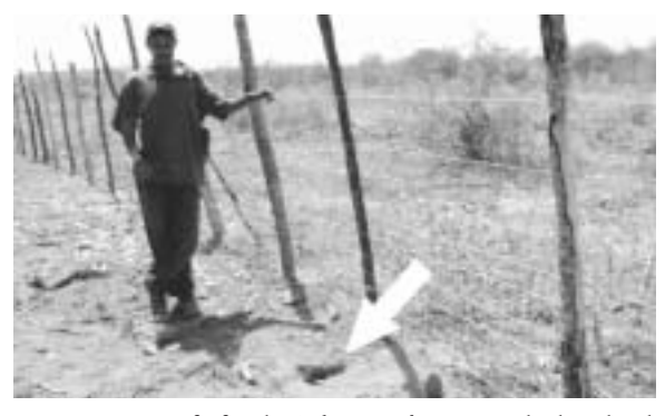
Nesting attempts of a female Cyclura ricordii in a recently cleared and fenced terrain on the fringes of Los Olivares.