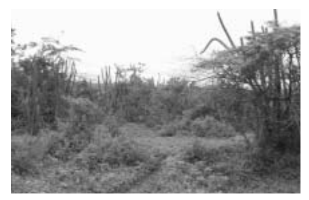
Vegetation in the Fondo de la Malagueta (October 2003).