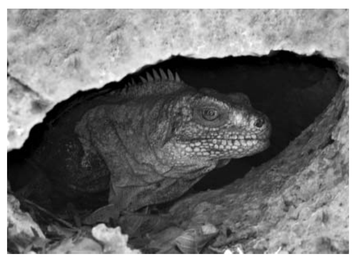
An adult Cyclura ricordii in a crevice in múcara east of "Los Olivares."