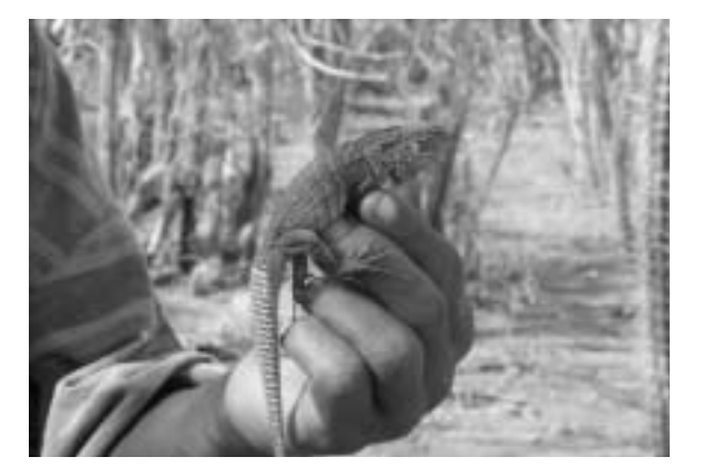
Hatchling Cyclura ricordii.