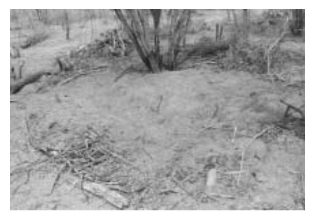
A "finished" Cyclura ricordii nest.

Nesting and Reproduction.—Female C. ricordii initiated nesting activities in early April 2003, possibly triggered by rain that fell in the area on 31 March and 1 April. On 8 May, we counted 28 finished nests along the 500-m transect in the Fondo de la Malagueta. We also confirmed nesting activities in the outer