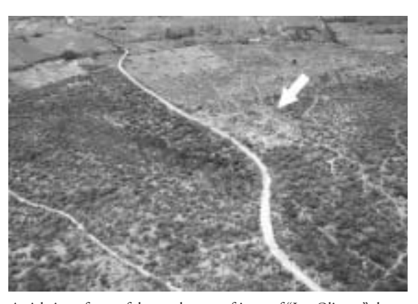
Aerial view of part of the northeastern fringes of "Los Olivares" showing the Pedernales–Las Mercedes road. Note the waste dump in the center of the photo and recent clearing of land close to the dump.

The larger subpopulation occupies an area that includes the outer fringes of Los Olivares towards the northeast, the marine limestone terraces that surround Los Olivares, and the plain above these limestone terraces. On the plain, one fondo of about 47 ha showed signs of very high Ricord's Iguana activity. This fondo, known locally as "Fondo de la Malagueta," is surrounded by patches of múcara, cascajo, and some smaller fondos. On an approximately 500 m-long transect (40 m wide) through the Fondo de la Malagueta, we counted 63 active burrows in May. Assuming that every active burrow is home to an adult animal, we calculated a density of 31.5 individuals per ha. The methods are certainly very crude and a more detailed investigation is appropriate, but the number gives an idea of the high density of adults in the fondo. We also noted the presence of juveniles and hatchlings. The incidence of C. cornuta seems to be low, with signs of activity limited to the southeastern corner of the fondo.