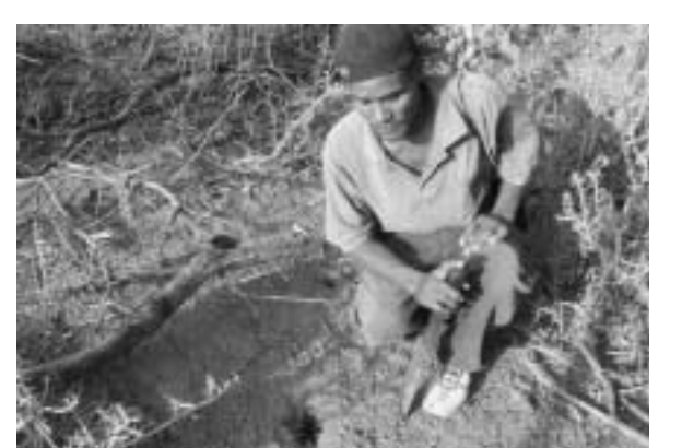
Successful hatching is indicated by the hole in this nest.

We only encountered two C. cornuta nests in the southeastern corner of the Fondo de la Malagueta. In the major part of the fondo, we found no evidence of nesting C. cornuta .