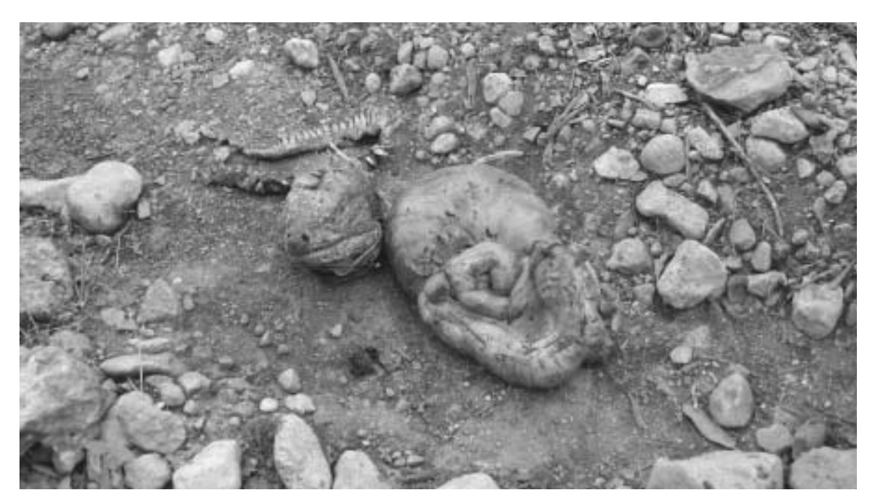
Remains of a dead iguana that was killed for meat.