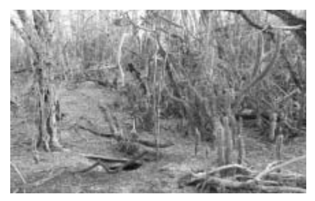
An active Cyclura ricordii burrow in the Fondo de la Malagueta (April 2003).