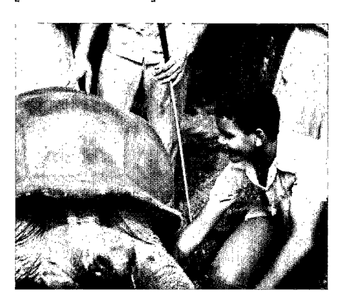
Touch reveals the strange forms of the turtle.

perfectly in their discipline of study or to understand partially or wholly abstract ideas, they can develop certains skills in zoology. The most important part of ZOODOM's work was to teach them to satisfy their immediate cognitive needs. We had to help them adapt to the school and familiarize them with the idea of conservation of natural resources, especially fauna.