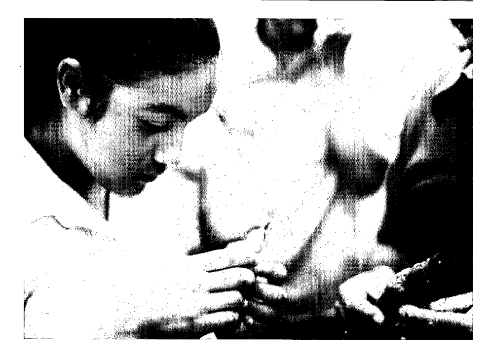
Deaf-mute child observing a crocodile replica.

Blind girl examining a bird.