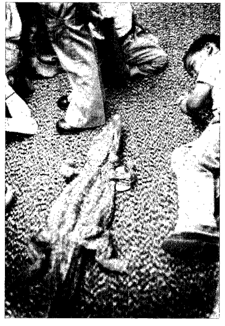
PARQUE ZOOLÓGICO NACIONAL, Santo Domingo. Deaf-mute children in a relaxed classroom session.