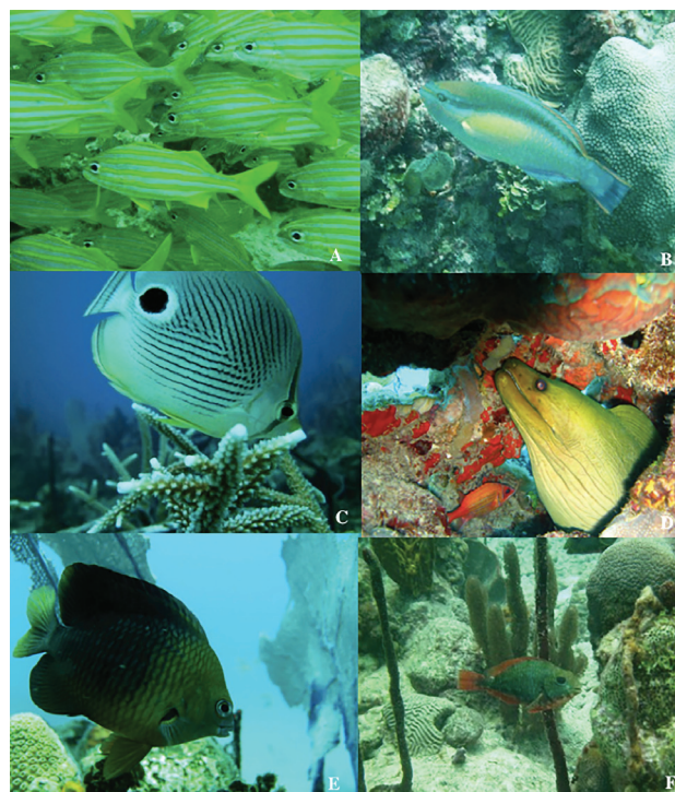
Figure 2. Some fish species belonging to species-rich genera in the SMASE: A) the Smallmouth grunt Haemulon chrysargyreum ; B) the Princess parrotfish Scarus taeniopterus ; C) the Four-eye butterflyfish Chaetodon capistratus ; D) the Green moray Gymnothorax funebris ; E) the Threespot damselfish Stegastes planifrons , and F) the initial phase of the Redband parrotfish Sparisoma aurofrenatum .

The list of species registered in this work constitutes the first record for the reefs La Pared, Coralina, Atlantic Princess, Magallán, Punta Cacón, and Pepito I and II, all in the SE region of the Dominican Republic.