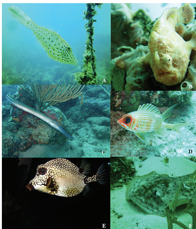
Figure 3. Some fish species in the SMASE: A) the Scrawled filefish Aluterus scriptus ; B) the Longlure frogfish Antennarius multiocellatus ; C) the Atlantic trumpetfish Aulostomus maculatus ; D) the Longspine squirrelfish Holocentrus rufus ; E) the Smooth trunkfish Lactophrys triqueter, and F) the Yellow stingray Urobatis jamaicensis.