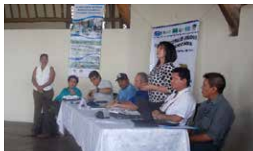
Table of representatives: DIPESCA, CONAP, Municipality of Livingston, Fishermen's Network and project consultants.