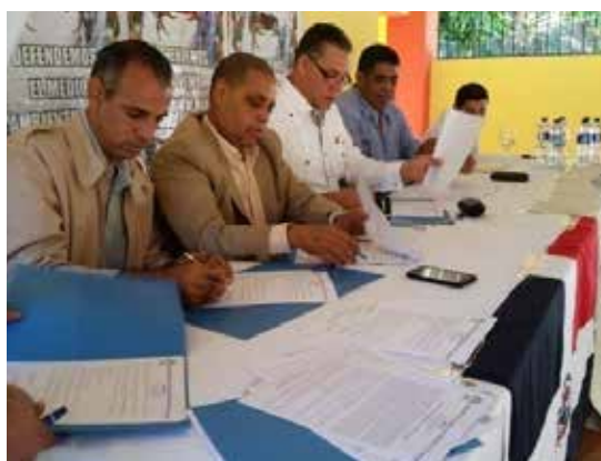
Signing agreements with the community institutions and the district boards.