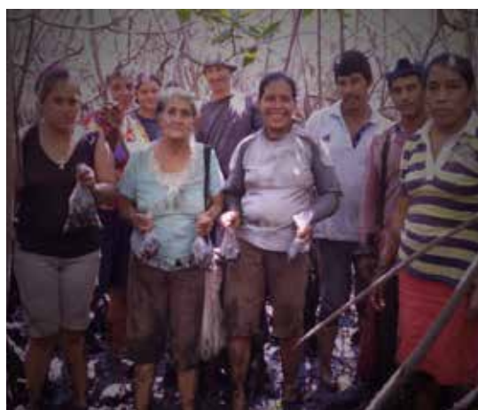
Working day to repopulate the concha negra shellfish in mangrove concessions.