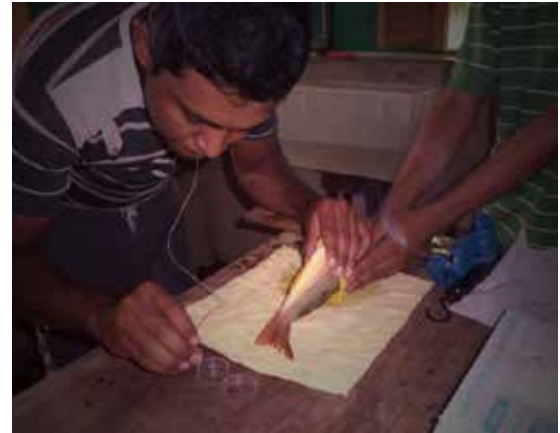
Hormonal induction of the Spotted Rose Snapper.

The ADPG (Asociación para el Desarrollo de Pedro García, Inc.) project in the Dominican Republic involved training workshops, developing environmental initiatives, and engaging civil society with local authorities to promote environmental protection. The project worked with schools, community committees, two municipalities, two district municipalities, other local and national governments, as well with the general public of the two main municipalities of Pedro García and Yásica. Environmental campaigns at first were done very locally, but afterwards these campaigns aimed to influence areas outside the projects limits, up to the point that an environmental service fee was being negotiated with another district in the lower basin for the protection and quality of spring water found in the upper basin (Pedro García and Yásica). In Pedro García, the interest of implementing the three Rs (recycling, reusing, and reducing) has extended to schools, where teachers inspired by the project’s initiative have also began to implement actions in their schools. The main achievements are: