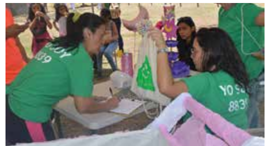
Community project in the district El Hatillo: neighbors and environmental leaders.