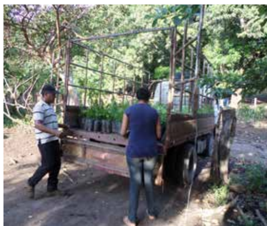
Delivering the forest plant seedlings to the community of Kilaka