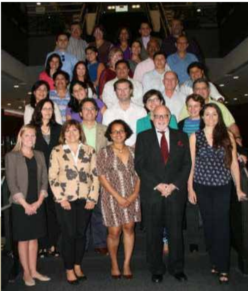
Pathways to Cleaner Production Higher Education Partnership representatives from U.S. and Latin American universities, WEC, and HED during the 2013 partnership annual meeting at IITs campus in Chicago, Illinois.

Several capacity-building events, supported by HED, have created environments for systematic collaboration and information sharing among the partners. For instance, the Universidad San Ignacio de Loyola (USIL) held an event, “Pathways to Cleaner Production for Micro-, Small-, and Medium-Sized Enterprises” , which hosted faculty, students, and representatives from WEC, industry, and the Government of Peru, to expand awareness of the partnership’s work and how CP solutions result in cost savings and long-term sustainability. Also, during the Pathways to Cleaner Production Annual Meeting in Chicago, Illinois, the fourth round of faculty capacity-building workshops were held at the Illinois Institute of Technology (IIT) ( “Diagnostics and Energy Audit for Cleaner Production,” “Life Cycle Assessment and Ecodesign,” and “Business Case and Implementation Strategy for Cleaner Production” ). Twenty-one participants attended the workshop, including 20 faculty members and one representative from the National Cleaner Production Center in El Salvador, greatly increasing their knowledge of CP and SID practices.