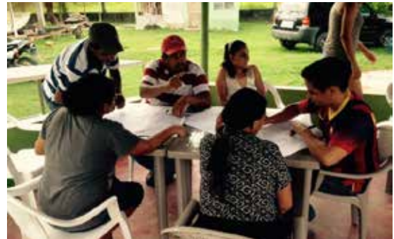
Training for the establishment of gardens in the project communities.