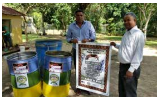
Delivering recycling containers at an Education Center.

The FUNDEMAS project in El Salvador had two main components: (1) training and awareness on environmental protection, and (2) communication and outreach strategies to broaden the impact of the project's key messages on environmental protection. Specifically, this project sought to increase the awareness of civil society on the issues of natural resource management and environmental regulations and procedures in order to promote participatory and informed decision-making in matters of environmental protection through educational and training activities in the municipality of San Salvador. The main achievements were: