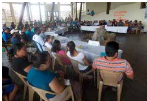
Inter-institutional working table of the three selected fisheries.