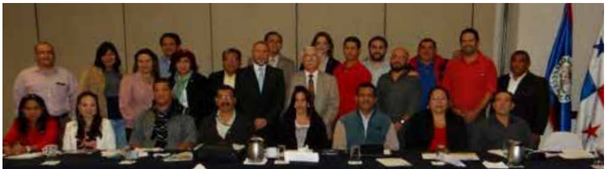
Regional Expert Consensus Workshop for the Procedures for Making NDFs for species of sharks and rays of CITES Appendix-II in Central American Integration System (SICA) member countries in Guatemala City, Guatemala, January 2015.