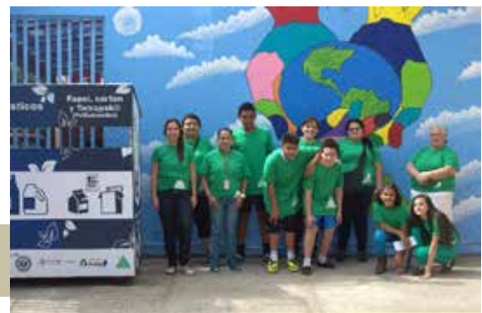
Community project in the district San Sebastian: environmental leaders, the Ecopoint, and mural.