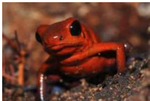
Poison arrow frog.

The purpose of Theme B is to protect wildlife and its habitat for long-term economic and environmental development. Initiatives related to this theme seek to combat illegal trade in endangered species and promote sustainable management of forests, protected areas and other important ecosystems. Key focal areas include strengthening the scientific and institutional capacities of authorities in charge of the Convention on International Trade in Endangered Species of Wild Fauna and Flora (CITES), training CITES implementation officials, building wildlife enforcement capacity and networks, supporting new or existing animal rescue centers, and preventing illegal logging. Results and impacts associated with Theme B are divided in two broad categories: