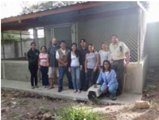
Capacity building workshop on animal handling.

The Dominican Republic was not included in work carried out with rescue centers, as it did not have viable rescue center partners. However, as part of a region-wide initiative, HSI created a Spanish-language interactive animal handling curriculum CD and field guide and trained border officials, customs agents, national police forces and government representatives to replicate future training. The animal handling CD is an ideal tool for border posts and jobs with a high-level of turnover, as it can be left at the post, is fully interactive, and comes with a pocket-size booklet. In the Dominican Republic, where poachers raid the nests of hispaniola parrots, this product has been extremely helpful in teaching how to care for young confiscated birds.