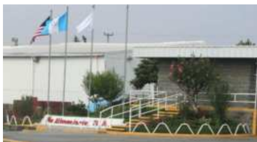
The Neoalimentaria Company from Guatemala participated in the project “Business alliances for compliance with trade and environment standards”

The first result captures what can be done on the “incentive” side of the process: policies can be developed and adopted, issue-based committees can be formed and incentives can be developed and implemented. The second result is directly focused on the behavior of enterprises. Enterprises that have awareness of, commitment to, and the capacity to undertake environmentally responsible action will use clean production technology, adopt eco-efficiency practices and use environment management systems. At this stage in CAFTA-DR ECP implementation, OAS-DSD is looking at the impacts generated by the adoption of these policies, incentives and the commitment demonstrated by the private sector to reduce its negative impact on the environment. Some field visits by the OAS-DSD team revealed a growing interest within universities and research centers for cleaner production methods. Researchers within these institutions were motivated by the desires to foster a more competitive private sector and to make a stronger contribution to the national efforts to contain or reduce greenhouse gas and pollutant emissions, the use of energy, water and raw materials, and the generation of solid waste and wastewater. As the research, dissemination of information and private sector participation are expanding, impacts from the contribution of CAFTA-DR ECP are becoming more tangible.