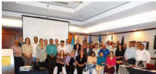
Capacity building workshop for CITES and fisheries authorities in the region.

Implementing agencies launched various initiatives to build and strengthen capacities and harmonize enforcement across the CAFTA-DR region. These initiatives include training government officials on CITES basic legal structures, implementation and enforcement; developing accessible, replicable training material; supporting the development of procedures and systems that increase the performance and effectiveness of CITES implementation; and developing tools to address limits on the implementation and enforcement of CITES. Other interventions focused on supporting wildlife rescue centers and strengthening regional collaboration and synergy.