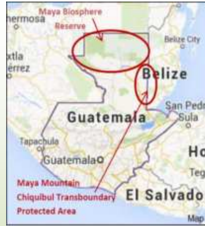
Map of Guatemala – Belize Transboundary Protected Areas

In Guatemala, leaders from four municipalities in southern Peten (Melchor de Mencos, San Luis, Poptún, and Dolores, jointly referred to as the Commonwealth of Municipalities of Southern Petén, or MANMUNISURP), signed a formal agreement to work collaboratively. Together, they drafted a document called “Environmental Security Strategic Plan for the Southern Petén” to guide their activities. Moreover, two CSOs, Balam Guatemala and Friends for Conservation and Development (FCD), from Belize, joined forces to demonstrate the benefits of working with its counterparts across the border in Belize, to strengthen shared transboundary protected areas. As a result, MANMUNISURP has finalized and begun implementing a “Guatemala-Belize Bi-national Action Plan” to guide work, and has approved an “Environmental Security Strategy for the Maya Mountains-Chiquibul Biosphere Reserve (MMCBR)” that provides for joint patrols in critical MMCBR areas and for the placement of mobile control posts along primary trafficking routes. As a result, 224.12 cubic meters of timber (mostly rosewood), valued at approximately USD 300,500, were confiscated in February and October 2013. 1 Other examples include community advisory groups developed along the Angue River, in El Salvador, to protect the ecosystem and the community along the river. As a result of capacity-building efforts, this community is now empowered and capable to continue work