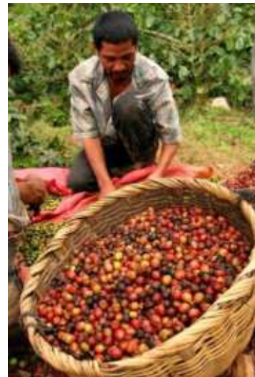
Coffee grower

RA also promoted the benefits of certification on all actors along the supply chain. In 2011, the scope of the initial certification project was expanded to include a study tour. This allowed CAFTA-DR producers to learn about marketing from farmers in countries participating in the Pathways to Prosperity in the Americas Initiative. This expanded project reinforced the institutional linkages and allowed Colombian coffee producers to share their best practices with Central American coffee producers. Colombia has a long history of innovation in the coffee production industry. Participating Central American coffee farmers learnt about the importance of a strong institutional framework at the national level, crop management, quality control and competitiveness. The participants demonstrated a strong commitment to natural resource conservation and a willingness to implement best management practices and improve technology to promote efficiency and better productivity: