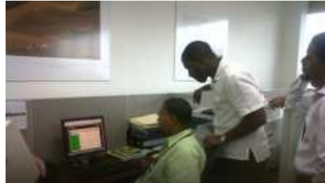
Single Entry Unit, Ministry of Environment and Natural Resources, Dominican Republic.

Under this Goal, the purpose is to strengthen environmental institutions, laws and policies, and to promote effective implementation and enforcement of these laws and policies, as well as the effective implementation of Multilateral Environmental Agreements (MEAs) and civil society engagement to ensure compliance with Free Trade Agreement's (FTA) obligations.