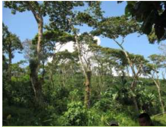
Agroforestry system

In 2012, USFS convened a meeting with international donors involved in the prevention of illegal logging to ensure that key actors in Honduras such as the German International Cooperation Agency (PROTEB project), Socodevi (Canada), the European Union and USAID-CCAD (ProParque project) would oversee different aspects of ENCTI. This meeting was conducive in building collaboration between the Rainforest Alliance (RA) in Guatemala, the USAID-CCAD ProParque project and USFS regarding the development of a carbon baseline for the Eastern part of Honduras. This baseline will not only yield information on carbon, but also provide a map of images to detect areas of deforestation and illegal logging. Moreover, the Government of Taiwan has committed to provide Rapid Eye images of the Rio Platano Biosphere. These images will be essential to detect deforestation and forest degradation.