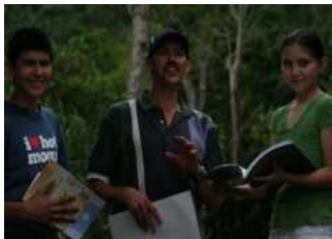
Training for cacao farmers

In this regard, RA met or exceeded the vast majority of its targets. It far exceeded its targets for the number of farms achieving RA certification and the number of people trained as a result of CAFTA-DR's ECP. Overall, since 2007, 20,500 Central American farmers have been certified for their production, either with the RA certification (around 20,000) or HSI (400). Additionally, RA built capacities among 7,000 farmers to achieve or maintain certification for economic, environmental and social best management practices as codified in the Sustainable Agriculture Network (SAN) standard, which is a strong indication of its potential to maintain results. Under HSI leadership, BioLatina in Nicaragua and EcoLogica in Costa Rica handled the organic certification process for the People in Community Action Cacao Cooperative (PAC) and the Association of Small Producers of Talamanca (APPTA) respectively.