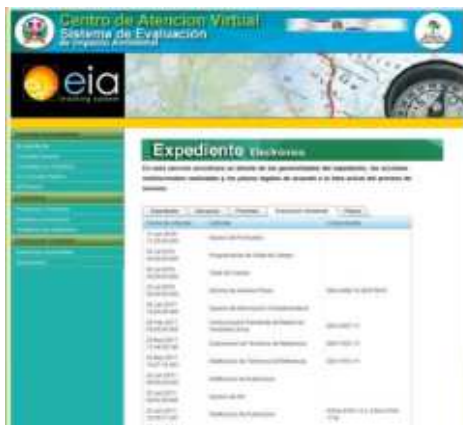
Electronic Record Consultation

delegates and CSO representatives from the environment, agriculture, health, academic and industrial sectors. Training participants are now more knowledgeable in effective application of, and compliance with, environmental legislation. USAID-CCAD and EPA technical assistance was also directed at improving Environmental Impact Assessment (EIA) processes and environmental inspection/criminal enforcement techniques to the public and private sector. This contributed to a regional system of environmental compliance indicators and a system for registering and certifying environmental service providers. It also facilitated the adoption and application of cleaner production and voluntary agreements. In addition, the Regional Visualization and Monitoring System (SERVIR), a satellite-based program, was disseminated in the region, providing very useful data to mitigate natural disasters and threats, improve agricultural practices, and monitor air quality.