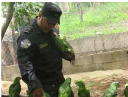
Seizure of parrots by government officials of El Salvador.

Over time, DOI-ITAP support to CITES implementation and enforcement led to consolidated wildlife enforcement operations and to the building of multidisciplinary inter-agency teams comprising representatives of stakeholders like the Head Environmental Prosecutor's Office, the Vice-Ministry of