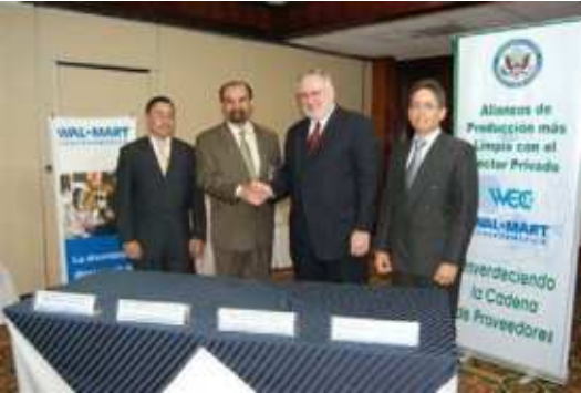
Greening the supply chain - Cleaner Production Partnership with the private sector.

committed to include cleaner production and EMS modules in undergraduate, graduate, and free courses to be delivered by over 400 teachers. WEC-HED launched in 2012 the Pathways to Cleaner Production Initiative, and so far it has trained nearly 100 teachers, students and other stakeholders in cleaner production. Throughout the region, hundreds of students have graduated from environmental, industrial and chemical engineering and business management programs with a focus on cleaner production. Most of them have undertaken internships within SMEs, where they have performed environmental audits, developed EMSs and proposed tangible solutions for reducing SMEs' impact on the environment, while increasing their profitability and competitiveness. The CPCs play an active role in supporting academic institutions and students to develop curricula, skills and innovative knowledge to expand the use of cleaner production and seek improved solutions. The young generation is passionate about cleaner production as part of an emerging culture of sustainable development and environmental awareness.