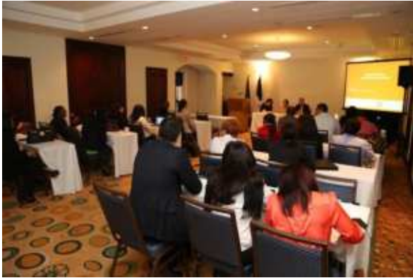
Government officials at the Workshop on Public Participation for Sustainable Development (Santo Domingo, Dominican Republic)

Implementing agencies have worked with CAFTA-DR countries to improve 150 existing laws and adopt 28 new laws and regulations related to wastewater, air pollution, and solid waste. According to USAID-CCAD reports, other initiatives such as inspections (supported through the transparency initiative); audits (supported through work on Environmental Impact Assessments); national and regional reference laboratories; and voluntary agreements (supported through the cleaner production component) reinforced the implementation of wastewater and solid waste regulatory frameworks. CAFTA-DR ECP helped countries better meet environmental obligations of the CAFTA-DR agreement by providing training and workshops to government officials, private sector