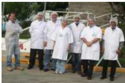
Visit to the Neoalimentaria Company, Guatemala.

Goal: To improve the environmental performance of the private sector