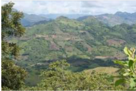
View of Miraflor-Moropotente protected area (Estelí, Nicaragua)

As a result of CAFTA-DR ECP support, 1.3 million ha of biological significance were under improved natural resource management. Over 1,581,771 people were reached by specific outreach campaigns in protected areas, and 33 workshops were organized in conjunction with DOI to address alternatives to poaching wildlife in rural communities and support alternative livelihoods. Over 1,107 people were trained in eco-tourism and protected area management.