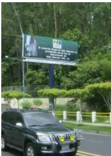
Billboard promoting Conservation of Wildlife

Each session presented real-life success stories in South America and Mexico involving the acquisition and operation of a social license.