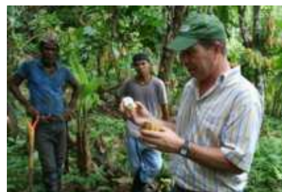
Capacity Building Association of Small Producers of Talamanca, Costa Rica

Improved management and conservation of the environment through: ecotourism, the production of crops favorable to the environment, and the commercialization of products and forest practices with ecological certification.