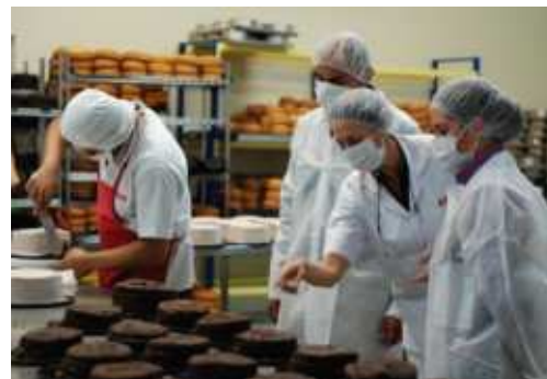
Cleaner Production Project, Costa Rica.

Cleaner production projects were implemented in Guatemala, El Salvador, Honduras, Nicaragua and Costa Rica. WEC trained selected SMEs locally to assist them in developing action plans to sustainably improve their manufacturing operations and environmental performance. WEC has worked with fewer enterprises than USAID/ELE but the examples that could be highlighted are just about the same in terms of environmental and economic benefits. Since the end of the project, many of these activities have continued. Some of the most noteworthy achievements arising from the project include: