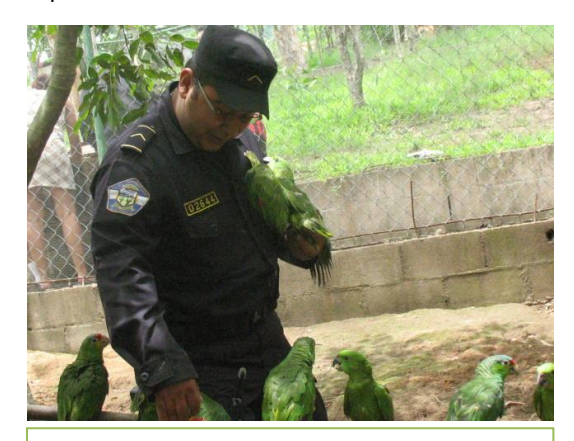
Seizure of parrots by government officials of El Salvador.

Over time, DOI-ITAP support to CITES implementation and enforcement led to consolidated wildlife enforcement operations and to the building of multidisciplinary inter-agency teams comprising representatives of stakeholders like the Head Environmental Prosecutor's Office, the Vice-Ministry of