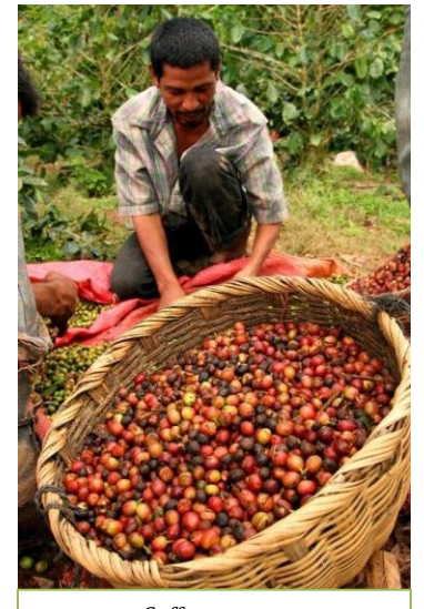
Coffee grower

"[...] We made comparisons about the ways coffee is produced and traded in our country and in Colombia and we realized the importance of government support, that in our country is small or absent. Colombia embraced coffee production as a