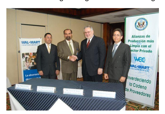
Greening the supply chain - Cleaner Production Partnership with the private sector.

committed to include cleaner production and EMS modules in undergraduate, graduate, and free courses to be delivered by over 400 teachers. WEC-HED launched in 2012 the Pathways to Cleaner Production Initiative, and so far it has trained nearly 100 teachers, students and other stakeholders in cleaner production. Throughout the region, hundreds of students have graduated from environmental, industrial and chemical engineering and business management programs with a focus on cleaner production. Most