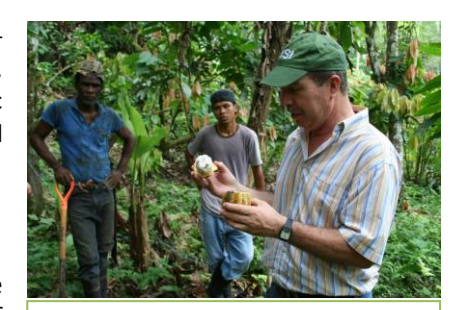
Capacity Building Association of Small Producers of Talamanca, Costa Rica

Improved management and conservation of the environment through: ecotourism, the production of crops favorable to the environment, and the commercialization of products and forest practices with ecological certification.