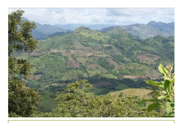
View of Miraflor-Moropotente protected area (Esteli, Nicaragua)

As a result of CAFTA-DR ECP support, 1.3 million ha of biological significance were under improved natural resource management. Over 1,581,771 people were reached by specific outreach campaigns in protected areas, and 33 workshops were organized in conjunction with DOI to address alternatives to poaching wildlife in rural communities and support alternative livelihoods. Over 1,107 people were trained in ecotourism and protected area management.