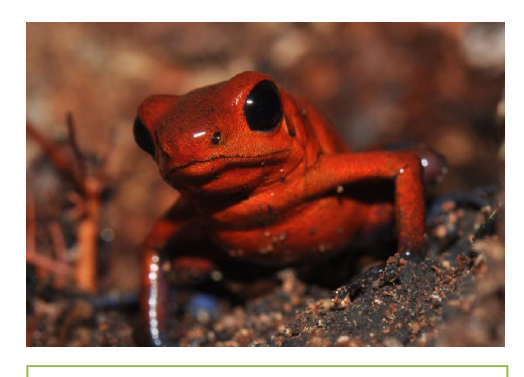
Poison arrow frog.

The purpose of Theme B is to protect wildlife and its habitat for long-term economic and environmental development. Initiatives related to this theme seek to combat illegal trade in endangered species and promote sustainable management of forests, protected areas and other important ecosystems. Key focal areas include strengthening the scientific and institutional capacities of authorities in charge of the Convention on International Trade in Endangered Species of Wild Fauna and Flora (CITES), training CITES implementation officials, building wildlife enforcement capacity and networks, supporting new or existing animal rescue centers, and preventing illegal logging. Results and impacts associated with Theme B are divided in two broad categories: