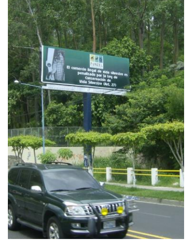
Billboard promoting Conservation of Wildlife

report on CITES trade data from Central America and the Dominican Republic, spanning over a period of 10 years. This study will feature an assessment of trade participants and primary Central American species of flora and fauna involved, as well as a preliminary analysis of the economic value of CITES trade in the region.<sup>23</sup> Also, for 2011-2012, DOI provided technical assistance to the conduct of a diagnostic study of