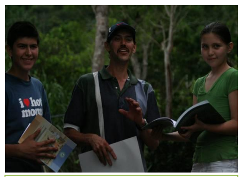
Training for cacao farmers

In this regard, RA met or exceeded the vast majority of its targets. It far exceeded its targets for the number of farms achieving RA certification and the number of people trained as a result of CAFTA-DR's ECP. Overall, since 2007, 20,500 Central American farmers have been certified for their production, either with the RA certification (around 20,000) or HSI (400). Additionally, RA built capacities among 7,000 farmers to achieve or maintain certification for economic, environmental and social best management practices as codified in the Sustainable Agriculture Network (SAN) standard, which is a strong indication of its potential to maintain results. Under HSI leadership, BioLatina in Nicaragua and EcoLogica in Costa Rica handled the organic certification process for the People in Community Action Cacao Cooperative (PAC)