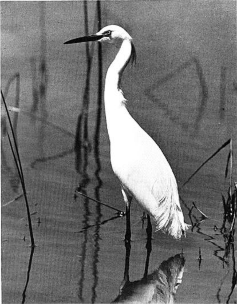
Snowy Egret (Leucophoyx thula). at Aransas Refuge, Texas, April 1948.