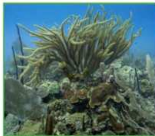
SOFT CORAL CORAL BLANDO