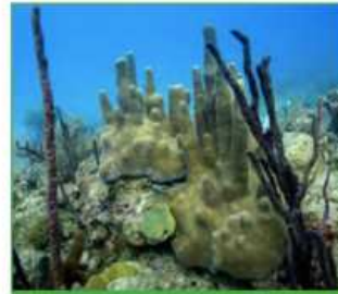
PILLAR CORAL CORAL PILAR