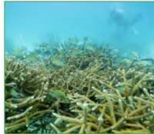
STAGHORN CORAL CORAL CUERNO DE CIERVO