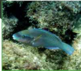
PARROT FISH PEZ LORO