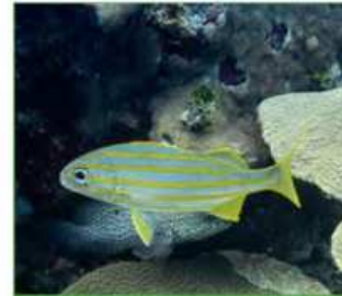
FRENCH GRUNT FISH PEZ RONCADOR