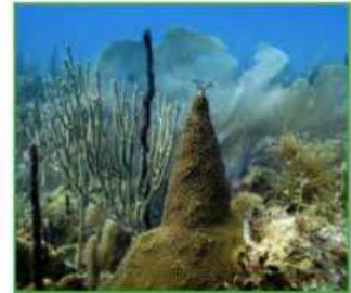
MONTASTRAEA CORAL CORAL MONTASTREA