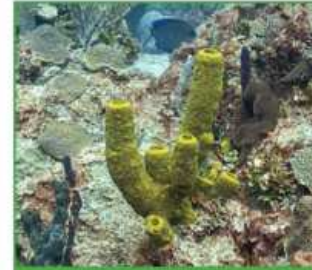
YELLOW TUBE SPONGE ESPONJA TUBULAR AMARILLA