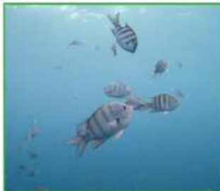
SERGEANT MAJOR FISH PEZ SARGENTO MAYOR