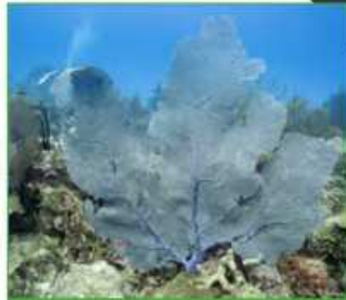
FAN CORAL CORAL ABANICO

El objetivo de este es simple—encuentra los tantos animales y plantas de la siguiente lista durante el viaje virtual y marca las casillas cuando logres verlos. Las fotos son para inspiración; los objetos pueden verse ligeramente diferentes durante el evento. ¡Buena suerte!