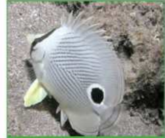
FOUR-EYE BUTTERFLY FISH PEZ MARIPOSA CUATRO OJOS