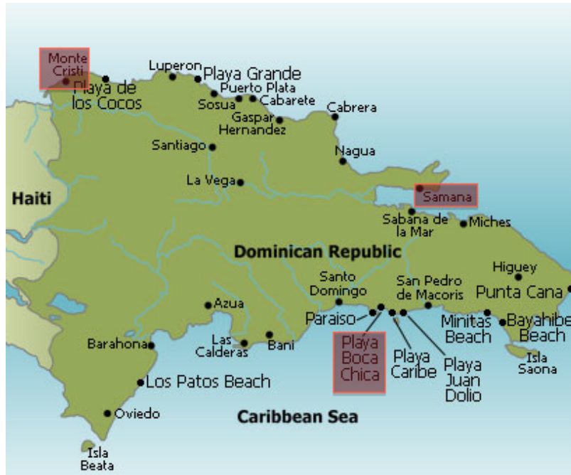
Figure 1 Map of the Dominican Republic, with the three study site communities highlighted.

While the World Bank classifies the Dominican Republic as an upper middle-income country, the nation suffers severe inequality in income distribution as more than 40 percent of its people live at or below the poverty line (Caffrey et al., 2013). A majority of the residents in the study sites suffer from income inequality and poverty, with some representation of the poorest ten percent of the population (Caffrey et al., 2013). USAID (2013) characterized Samana and Montecristi, as well as rural areas surrounding Santo Domingo (like La Caleta/Boca Chica), as communities with vulnerable individuals of low socio-economic status and limited formal education.