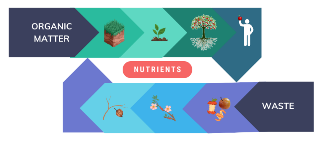
Figure 3. Circularity diagram of the agricultural sector.