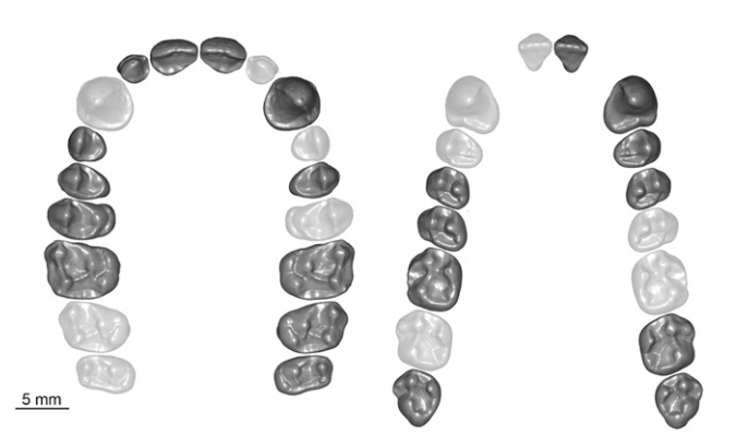
Fig. 2. Laser scan-generated images of the I. toussaintiana dentition. Individual teeth were scanned at 25 \mu m interpoint distances using an LDI RPS 120 laser scanner. The images were edited and rendered in Geomagic Studio 11. Dark gray teeth are part of the original UF 114714 assemblage, whereas light gray teeth are mirror images used to reconstruct a complete dental arcade. The exact shape of the palate is unknown and X. mcgregori was used as a guide in creating this image.