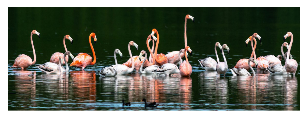
Figure 2. Flock of American Flamingo at Lagon-aux-Boeufs, Haiti.