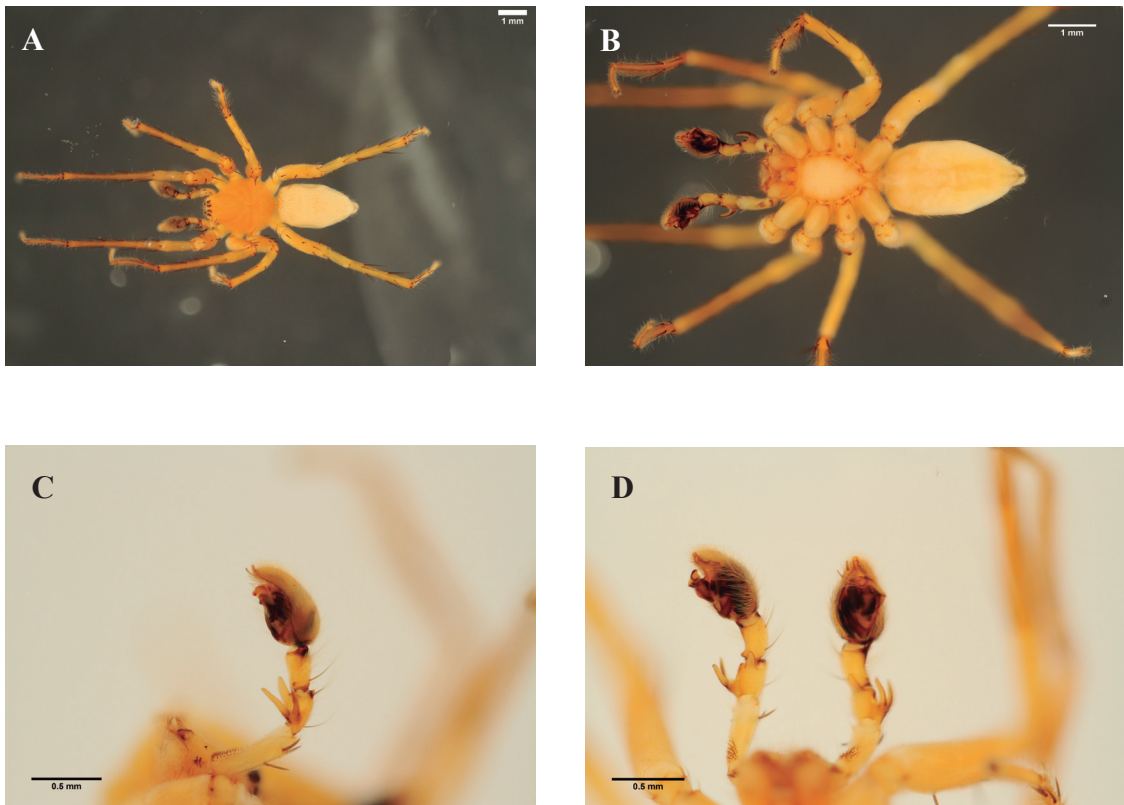
Figure 2. A-D, Thaloe ennery . Male. A, habitus, dorsal view; B, habitus, ventral view; C, left palp, retrolateral view; D, left palp, ventral view.

MNHNSD 09.27 (1♂): Pedernales Province. La Aguita, 1 km before El Banano crossing, 250 m. Side of the road. 14.VIII.1991. Sweep net. K. Guerrero col.