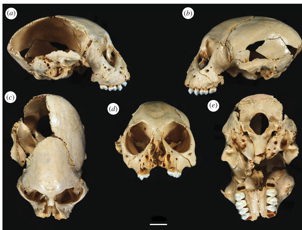
Figure 1. The Antillothrix bernensis skull (MHD-01) shown in several views: (a) right, (b) left, (c) superior, (d) anterior and (e) inferior. Measurements in millimetres (unless otherwise noted) include: maximum length of the incomplete skull lacking the premaxillae [78.75], cranial capacity [58 cm 3 ], interorbital breadth [6.62], biorbital breadth [44.38], orbital height [20.50], orbital width [18.51], post-orbital constriction [37.48], bimolar width [25.50] and nasion–basion [46.56]. Scale bar, 1 cm. See electronic supplementary material, tables S1 and S3.

The La Jeringa specimen also differs from the type in the number of roots found on P 3 and P 4 . The type has two roots on each of these teeth while the new specimen has three. Antillothrix teeth generally resemble Cebus and Saimiri in proportions and cusp patterns, although the crowns of squirrel monkeys are more cristodont while those of Capuchins are more bunodont. In this narrow frame of reference, Antillothrix postcanines would be categorized as being morphologically intermediate, though more similar to Saimiri overall, in part because the Cebus hypocone is large and connected to the trigon in its own distinctive way.