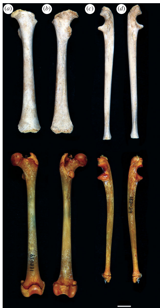
Figure 3. Comparison of the femur (a, anterior view; b, posterior view) and ulna (c, lateral; d, medial) of Antillothrix bernensis (top) and a male Cebus apella with unfused epiphyses (bottom). Scale bar, 1 cm. See electronic supplementary material, figures S5 and S6.

Like these cebines, P^{3,4} of Antillothrix are bucco-lingually wide, with wide shallow internal basins (figure 2). Each tooth has a large flaring protocone sidewall that lacks the distinct shelf-like cingulum seen in Saimiri and some Cebus . On P^4 , this region is angled mesially, giving the tooth a slightly bent or kidney-bean-shaped appearance in crown outline, which contributes to a large interproximal embrasure between P^4 and M^1 . This feature differentiates Antillothrix from modern cebines, where the P^{3,4} crowns tend to be simple transverse ellipses in occlusal view and P^4 is packed closely