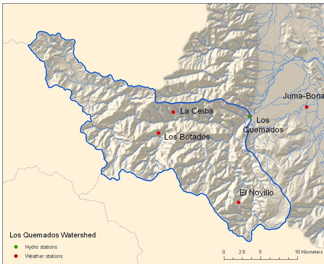
Figure 2. General Reference Map of Los Quemados Watershed