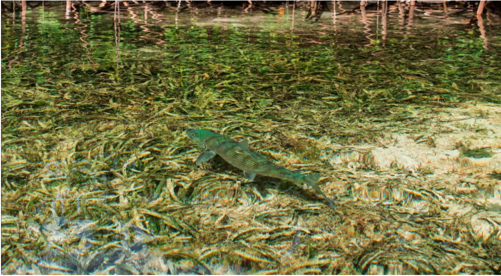
Bonefish cruising over seagrass along mangrove edge, East End, Grand Bahama