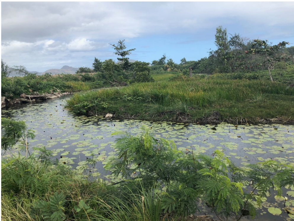
Cades Bay Wetland, Nevis, 2019.