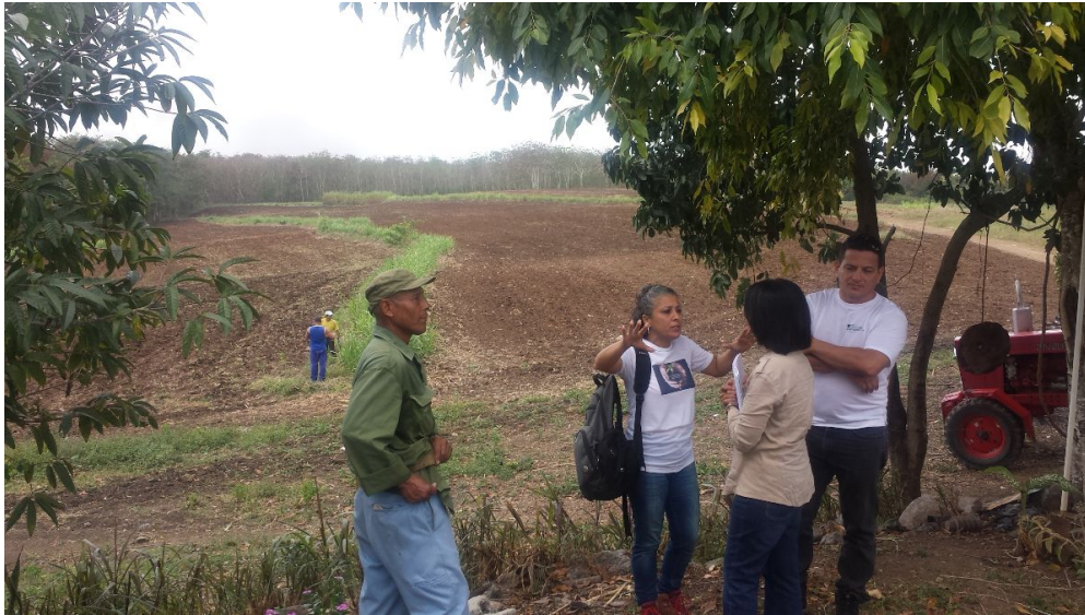
Mid-Term Review Mission, Cienfuegos Watershed, Cuba, January 2019