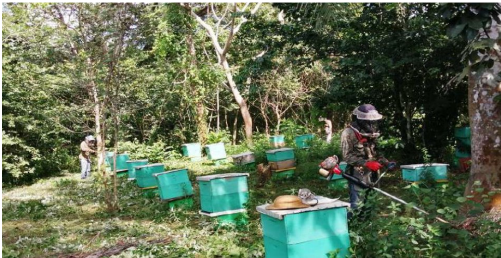
Apiaries established in the Higuamo Watershed, Dominican Republic.

We encourage Project partners, National Focal Points and national project management units to submit short items and links relevant to IWEco too!