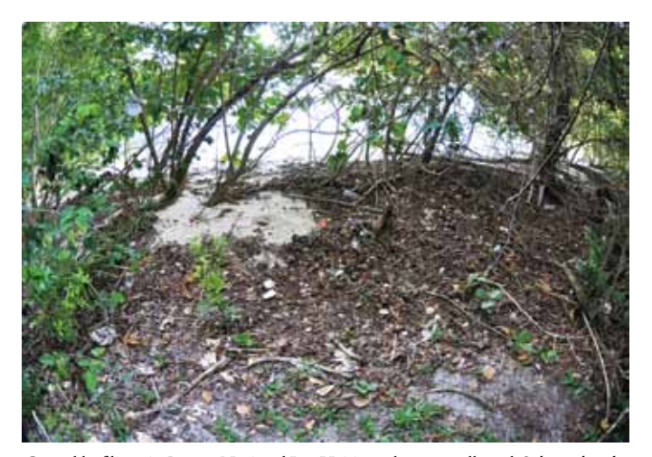
Coastal leaf litter in Parque Nacional Los Haitises where we collected Sphaerodactylus cochranae . The orange flag in the center of the image denotes the exact place where a gecko was first seen.