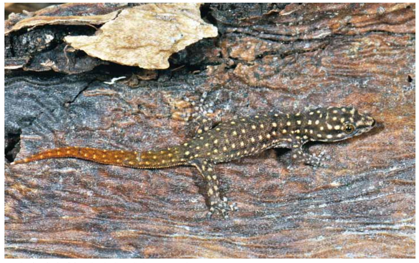
Juvenile Sphaerodactylus schuberti collected at the type locality near La Descubierta in August 2009.