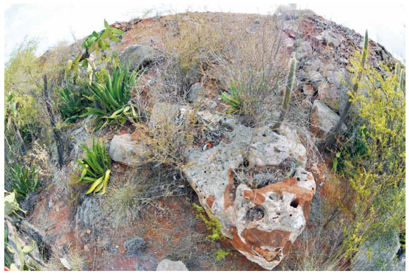
A fisheye view of typical habitat of Sphaerodactylus thompsoni and S. plummeri. Note the high percentage of exposed surfaces and xerophytic vegetation.

species to forage when surface temperatures have cooled substantially from daytime highs. However, we must note that we never observed S. plummeri active at night during surveys for S. thompsoni. Sphaerodactylus plummeri is approximately the same size as S. cryphius and lives in similar habitats on the southern part of the Barahona Peninsula. However, we readily collected S. plummeri during the day at the same sizes at which we collected S. thompsoni the night before. Although more research is necessary, this is highly suggestive of temporal niche partitioning.