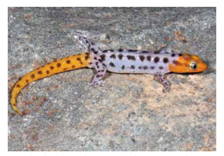
Male Sphaerodactylus leucaster from the karst hills of Monte Río, south of Azua. This lizard was active at night.