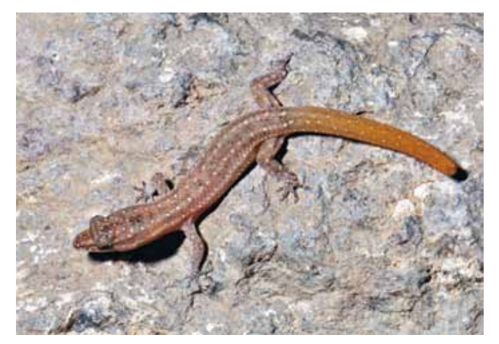
Juvenile female Sphaerodactylus ladae collected at night from Parque Nacional Francis Caamaño.

some recent observations of nocturnal or crepuscular activity patterns in five poorly known species from the Dominican Republic.