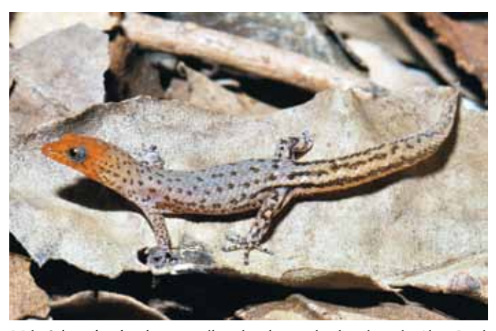
Male Sphaerodactylus plummeri collected at the type locality along the Alcoa Road in August 2009.

Nocturnality has evolved multiple times within Sphaerodactylus , and nocturnal sphaeros are largely restricted to hot and dry habitats. Although a more rigorous comparative analysis is necessary (and forthcoming), we hypothesize that nocturnality is an adaptation to xeric conditions as it would almost certainly reduce evaporative water loss by restricting activity to cooler periods. Such transitions between activity patterns may be facilitated if sphaeros are already pre-adapted to low-light conditions because of their semi-fossorial nature. Future work should investigate the ocular morphology of species in a comparative framework, as well as quantify activity across species in terms of ambient light conditions — instead of emphasizing time of day. The observation that S. leucaster and S. thompsoni possess vertically elliptical pupils, typical