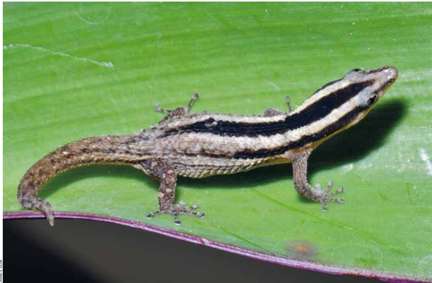
Female Sphaerodactylus cochranae perched on the top leaf of a bromeliad that is common at localities where this species lives. These geckos have been seen crawling in the axils of this plant at night.

Our success in finding and collecting S. ladae, S. leucaster , and S. thompsoni increased at night. Furthermore, we substantially reduced our impact on the habitat during nocturnal searches because we did not have to disturb dead Agaves and rock piles. Considering the close phylogenetic relationship of S. leucaster and S. thompsoni , we hypothesize that the related species S. asterulus, S. rhabdotus , and S. shrevei , which also inhabit xeric habitats, are