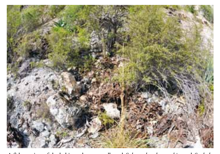
A fisheye view of the habitat where we collected Sphaerodactylus cryphius and S. rhab dotus during the day. This habitat, with a mixture of scrub vegetation, dead Agave , and limestone rocks is typical of localities where we have collected S. ladae and S. leucaster .