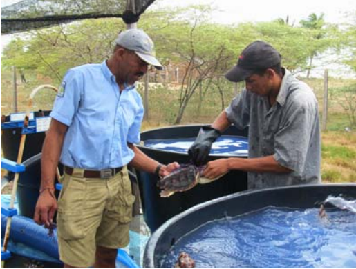
A marine turtle conservation project in Los Flamencos National Park