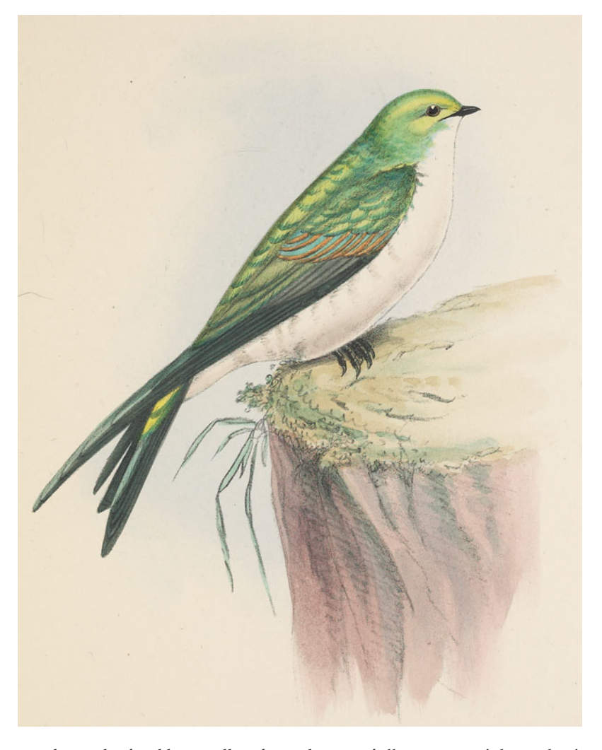
Figure 1. Lithograph of Golden Swallow from Plate 12 of Illustrations of the Birds of Jamaica (Gosse 1849).

road safety, cultural sensitivity, good sight lines, and distance from other census sites (minimum distance > 0.7 km). Census sites were located along paved roads, unimproved roads accessible with four-wheel drive vehicles, and along foot trails. Surveyed habitat included wet limestone forest, dry limestone forest, lower montane rain forest, mangrove forest, residential gardens and orchards, shaded coffee plantations, pasturelands with scattered old growth trees, church yards, ruinate woodland, and patchworks of secondary woodland, sugar cane, banana and coconut plantations, bamboo, agricultural scrub, and pasture. No censuses were conducted in plantation monocultures of sugarcane or in arid scrub lacking trees of sufficient stature ( \geq 10 m in height) along the southern coast. Ad hoc searches were conducted during several thousand kilometres of driving between census sites and on long distance trips though habitat that was outwardly unsuitable for swallows on the southern coastal plain.