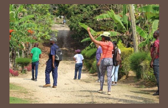
STEA Team exploring and assessing a potential attraction.

Critical Ecosystem Partnership Fund (CEPF) Fifth Call for Proposals Now Open