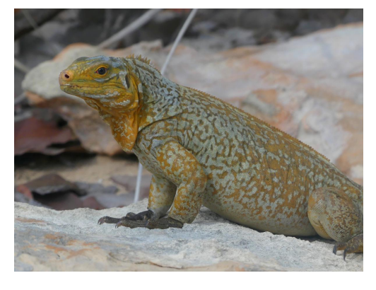
Adult female San Salvador Iguana ( Cyclura rileyi). The Bahamas.

CEPF has recently significantly expanded its portfolio in the Caribbean Islands Biodiversity Hotspot with the award of seven additional large and small grants in the Dominican Republic, Jamaica, Saint Lucia, and Saint Vincent and the Grenadines and at the regional level, between January and May 2023.