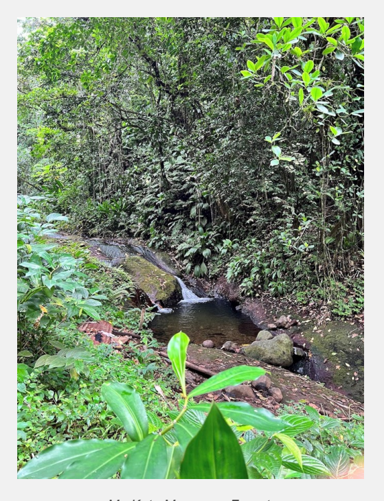
Ma Kote Mangrove Forest.

In this issue, we also look at the World Bank implementation support mission held in Jamaica earlier this year.