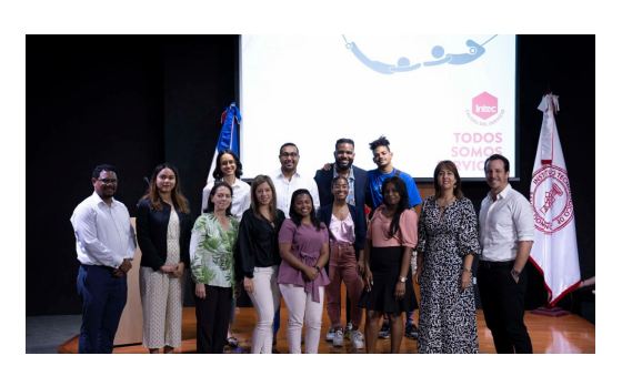
Diploma course graduation ceremony. Dominican Republic.