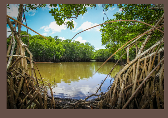
Fenton Falls trail. St Vincent.

Explore our interactive map of current CEPFfunded projects in the Caribbean: <u>https://storymaps.arcgis.com/stories/6b2618e2</u> <u>a26649dc8041af7f12ead197</u>