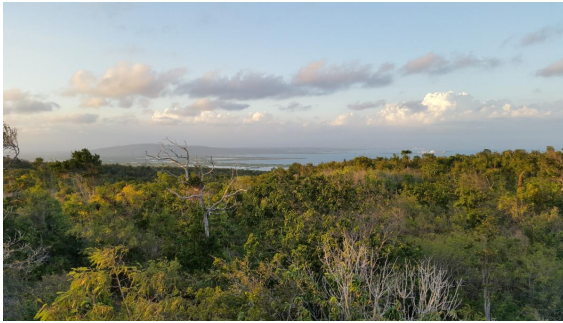
View from Portland Ridge to West Harbour, Jamaica

The Portland Bight Protected Area (PBPA) Key Biodiversity Area (KBA) is one of the most biodiverse areas in the Caribbean region. It is, however, facing various threats, including pollution, mining and alien species invasion. Learn more about the work done by the Caribbean Coastal Area Management Foundation (C-CAM) to mitigate threats to the PBPA and promote effective co-management of Jamaica's largest protected area.