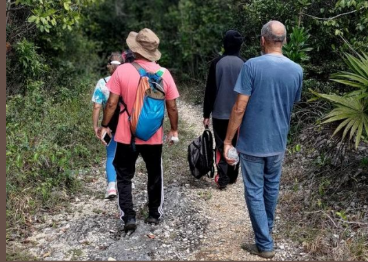
Cockpit Country, Jamaica

For more details on the grants that have been issued, click here .