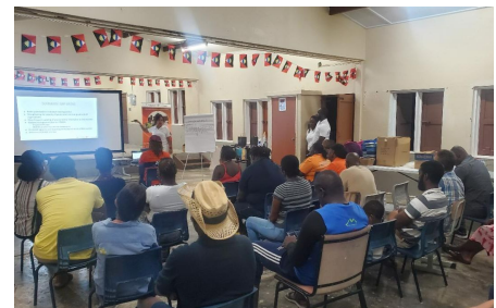
Community Meeting, Antigua & Barbuda