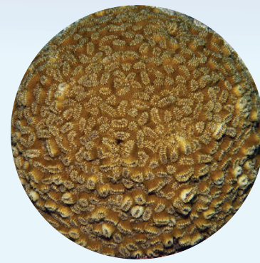
Healthy Stony Coral