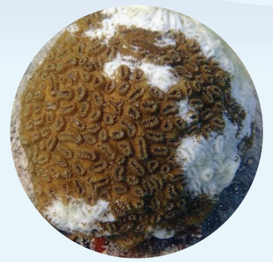
Sick Stony Coral