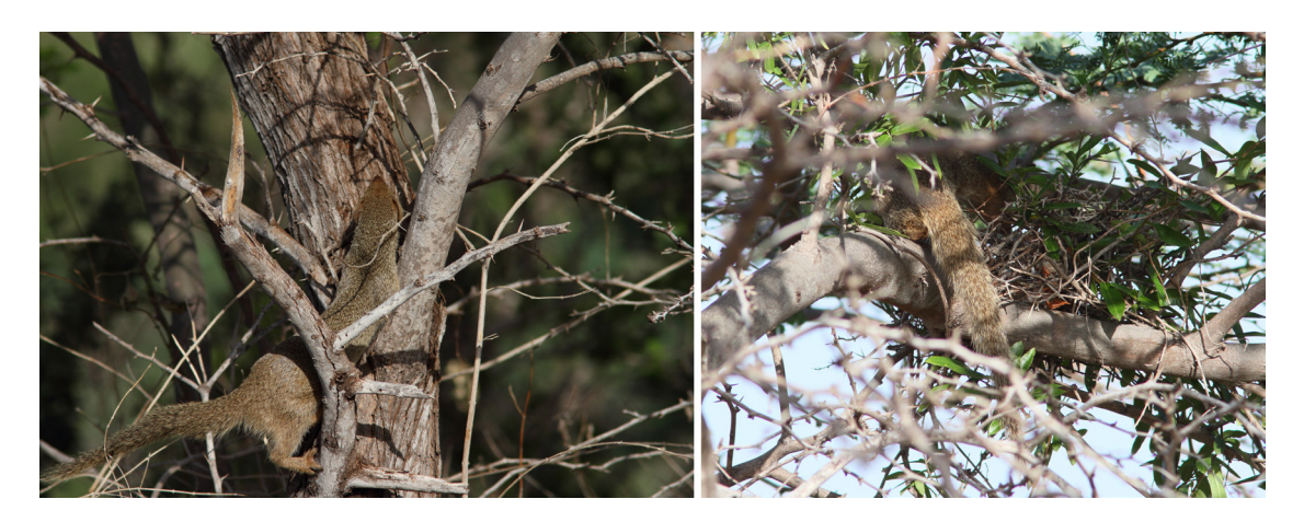
Figure 1. A Small Indian Mongoose climbing a tree (left) and then probing into a bird nest. Photos taken in the Alcoa road, near the Cabo Rojo area, Pedernales province, by M. A. Landestoy.