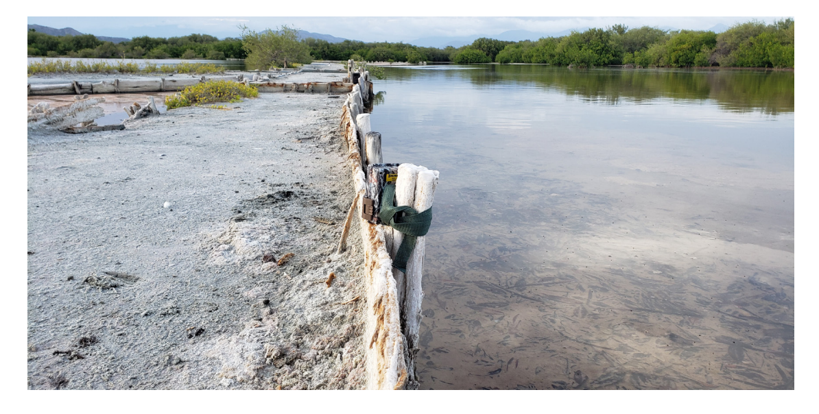
Figure 4. Pathway where the camera trap was placed. Note the water contained in the salt pan to the right half of the image behind the camera trap.