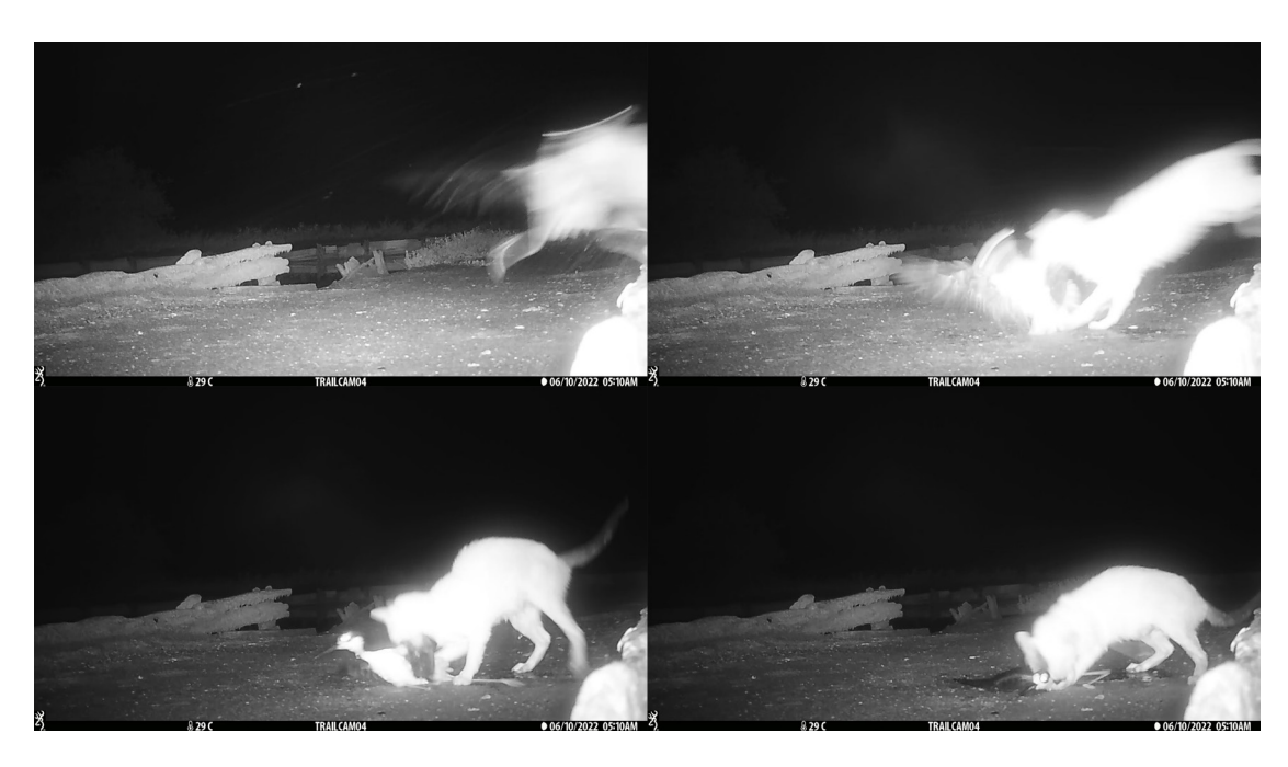
Figure 3. Sequence of video frame captures showing an adult cat landing after ambushing a Black-necked Stilt in a saltwater pan at Las Salinas de Puerto Hermoso, Peravia.