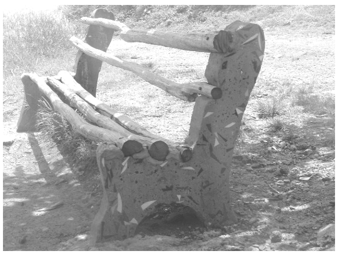
Figure 10.1 Bequia (Grenadines) bench made from cement and broken glass

MPAs should explore potential uses for waste material such as plastics which can be recycled, Glass bottles which can be crushed and used to make concrete structures (see figure 3), paper which could be shredded and used in chicken coupes and marine debris (e.g. seaweed) could be used for fertilizer. The extent to which MPAs can carry out such activities will vary from place to place depending on factors such as local facilities available, costs involved and viability.