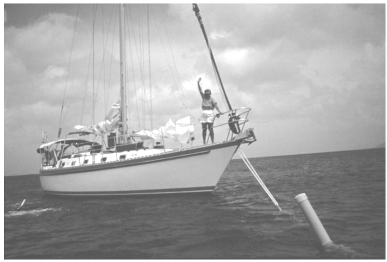
Figure 10.1 Dive boat on mooring in Bonaire Marine Park

on a regular basis. Regular users could be approached to help maintain these buoys. Mooring buoys may also serve as a source of income by charging a rental fee to users. There should be clear and well known rules for use of mooring buoys and these may include colour codes to identify different purposes such as range or size of boat and use of area (e.g. scuba diving groups, yachts, fishers, water taxi). Banning anchoring in coral reefs, encouraging anchoring in sandy areas, putting fines in place for damage and educating users to the damage that can occur to coral reef by anchors are some of the other ways of dealing with anchor damage.