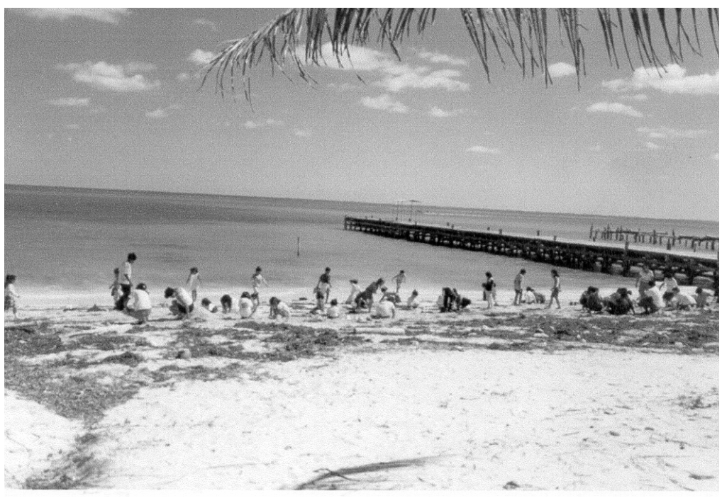
Figure 10.3 Sian Ka'an Biosphere Reserve (SKBR), Mexico beach clean-up

Stakeholders should be involved in reducing pollution and MPA management should actively seek support from local and international governments to help tackle pollution issues. MPA management should support and initiate programs outside the MPA to help combat sources of pollution such as reforestation activities, beach clean-ups and underwater cleanups.