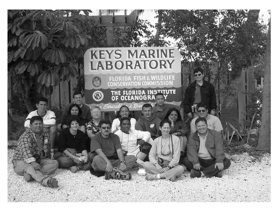
Figure 13.3 UNEP-CEP 'Training of Trainers' in MPA management, graduate class of 2004