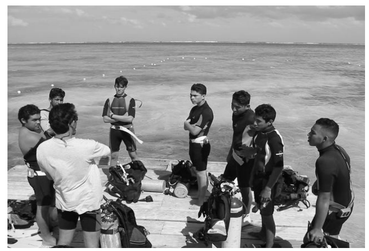
Figure 13.2 Hol Chan Marine Reserve (HCMR) SCUBA diving training

Jaragua National Park, Dominican Republic - Some of the youths from the community have been involved in monitoring hawksbill marine turtles and in training as tourist guides in the coastal zones. This has increased local awareness of the importance of the marine area of the Park and has generated enthusiasm and interest among the youth.