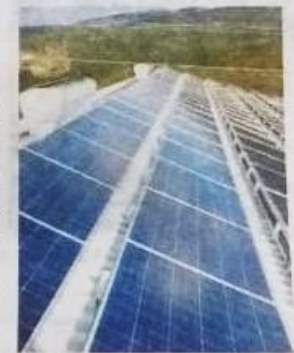
Paneles solares en SJM.