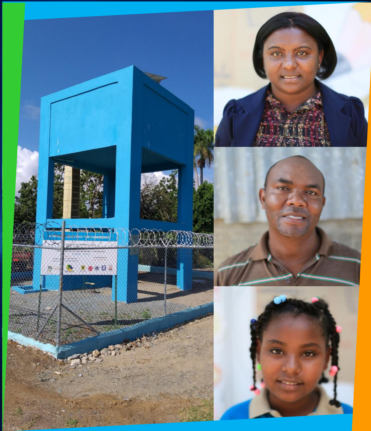
Los Cambrones Community, San Juan de la Maguana, D.R.