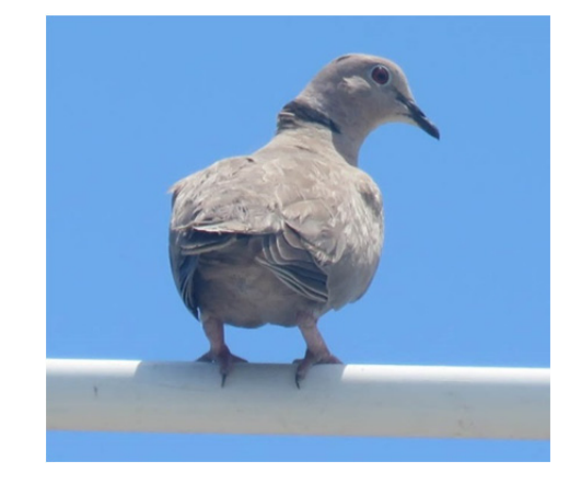
Figure 2. Eurasian collared dove ( Streptopelia decaocto ) perched on a TV antenna in Saona Island.