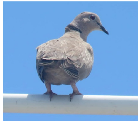
Figure 2. Eurasian collared dove ( Streptopelia decaocto ) perched on a TV antenna in Saona Island.