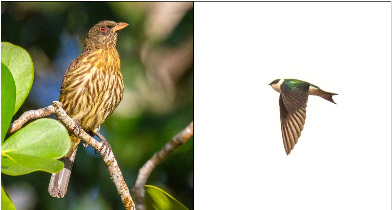
Palmchat, Cano Hondo and Golden Swallow, Alcoa Road

Regularly encountered around the agricultural fields at Rabo de Gato, with a maximum of six of these noisy Corvids seen on 28/03/22. A pair on the lower Alcoa Road on 30/03/22 and up to four in our Cano Hondo hotel grounds on both days of our stay.