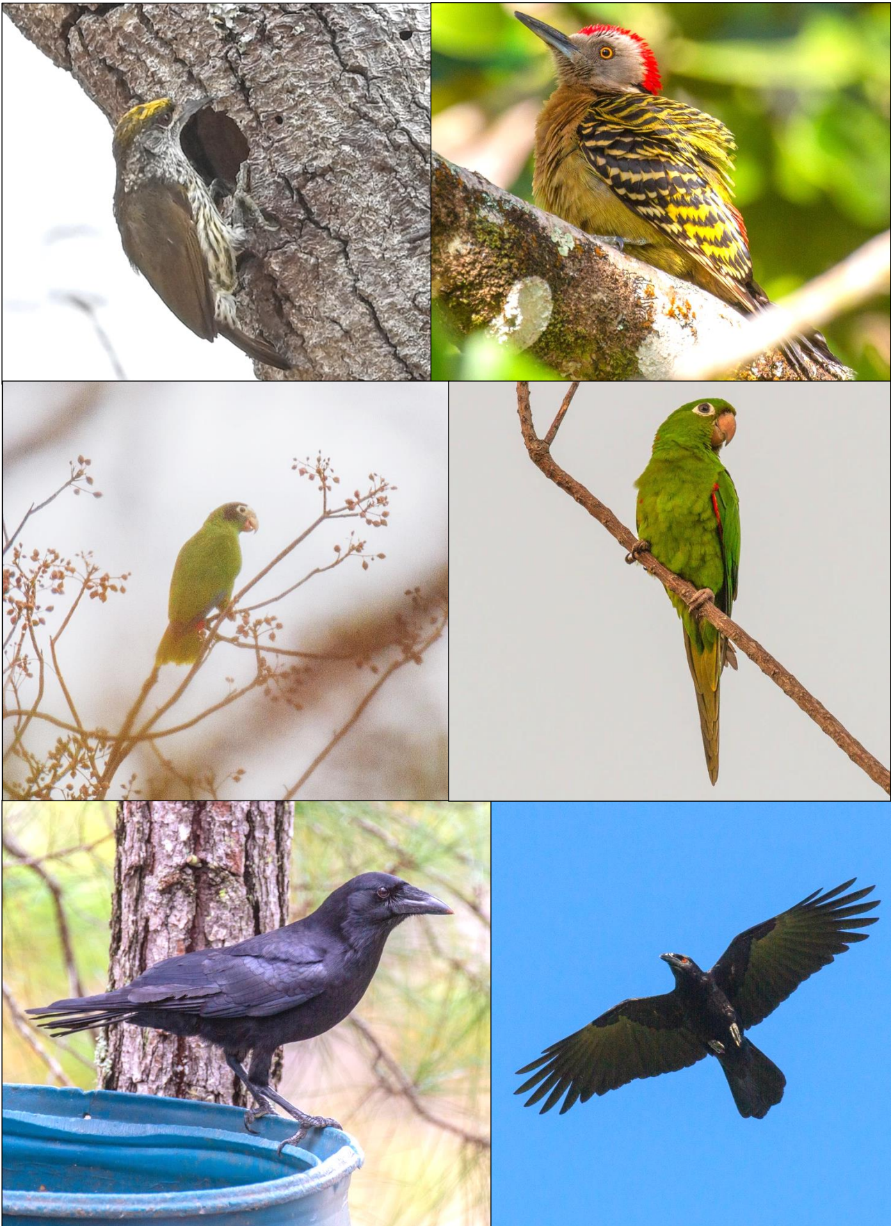
Antillean Piculet, Zapoten ; Hispaniolan Woodpecker, Cano Hondo; Hispaniolan Amazon, Rabo de Gato; Hispaniolan Parakeet, Santo Domingo; Hispaniolan Palm Crow, Alcoa Road; White-necked Crow, Cano Hondo