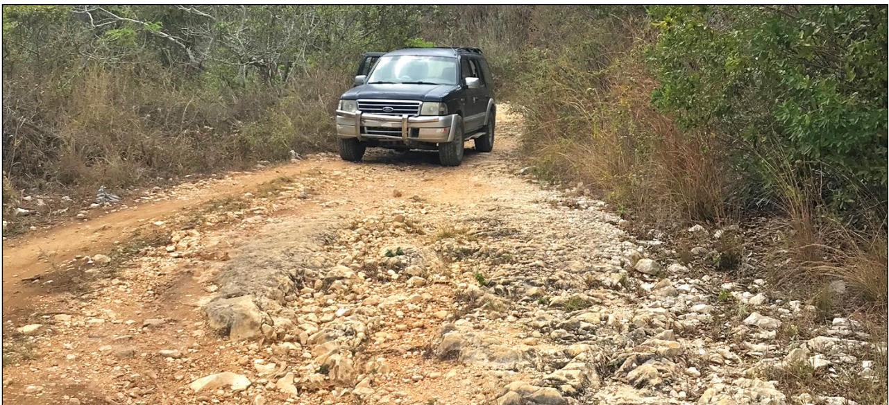
The 'road' to Zapoten, approached from the north; high clearance 4WD is a must!

Finally, in the face of global warming and the known impacts of air travel upon climate change, I would urge anyone undertaking journeys such as the one described above to consider carbon offsetting via the excellent scheme hosted by the World Land Trust .