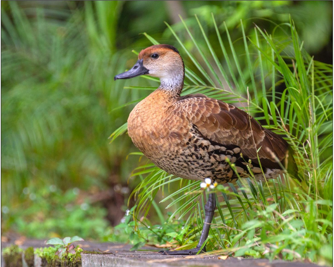
West Indian Whistling Duck, Santo Domingo Botanical Gardens

Five seen in Santo Domingo Botanical Gardens on 26/03/22. Two were unfeasibly close on an ornamental pond, three more in the creek below at 18°29'38.94"N 69°57'00.5"W. Perhaps one of the most reliable sites in the Caribbean for this very scarce species?