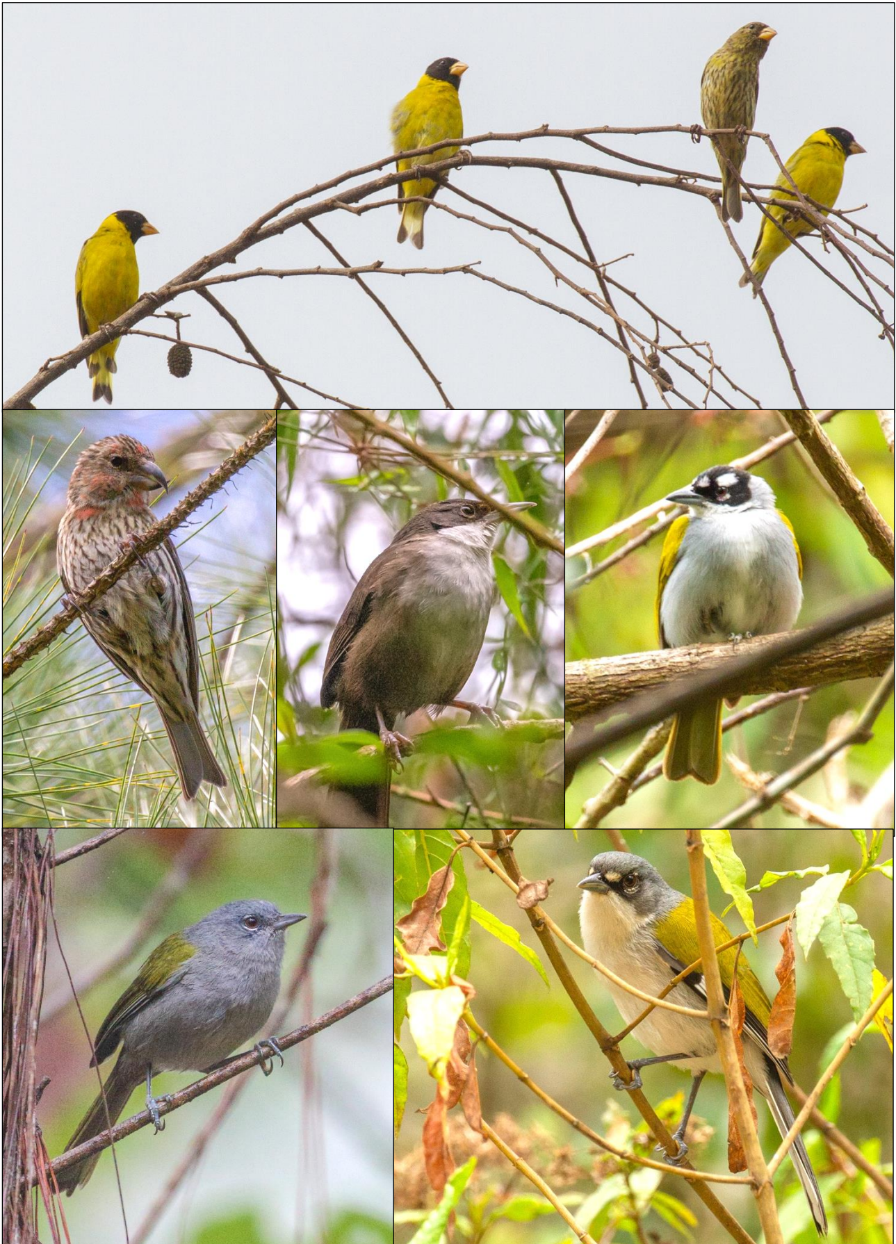
Antillean Siskin, Rabo de Gato; Hispiolan Crossbill, Loma de Hoz; Western Chat-Tanager, Zapoten; Black-crowned Tanager, Zapoten; Green-tailed Warbler, Zapoten; White-winged Warbler, Zapoten