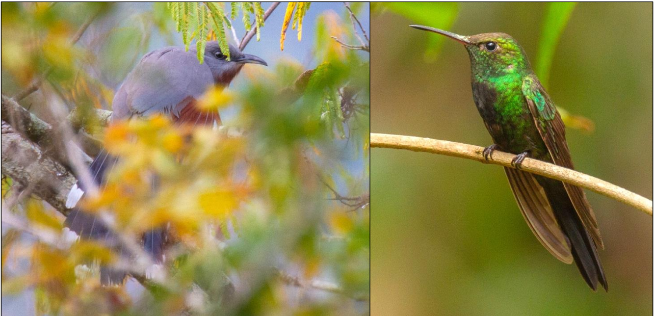
Bay-breasted Cuckoo and Hispaniolan Emerald, Rabo de Gato

Recorded at Rabo de Gato, Alcoa Road and Loma la Hoz, in small numbers.