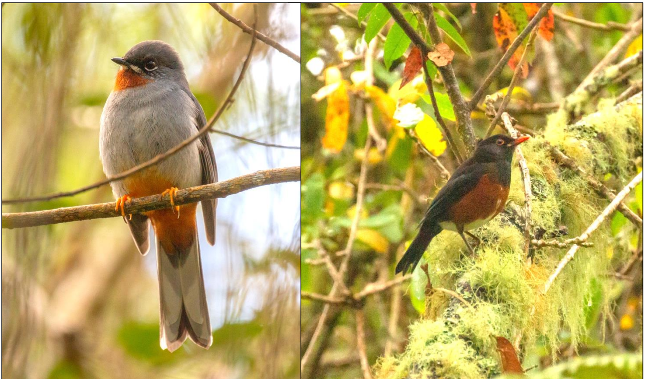
Rufous-throated Solitaire, Loma la Hoz and La Selle Thrush, Zapoten

Billed as a tricky bird to see well, the damp and overcast conditions during our morning at Zapoten played to our advantage and the thrushes remained active on the track until mid-morning; up to four seen and others heard. A large La Selle Thrush sign board announces one's arrival at what is now widely known as 'Thrush Corner' with our birds being seen from this point upwards for several kilometers.