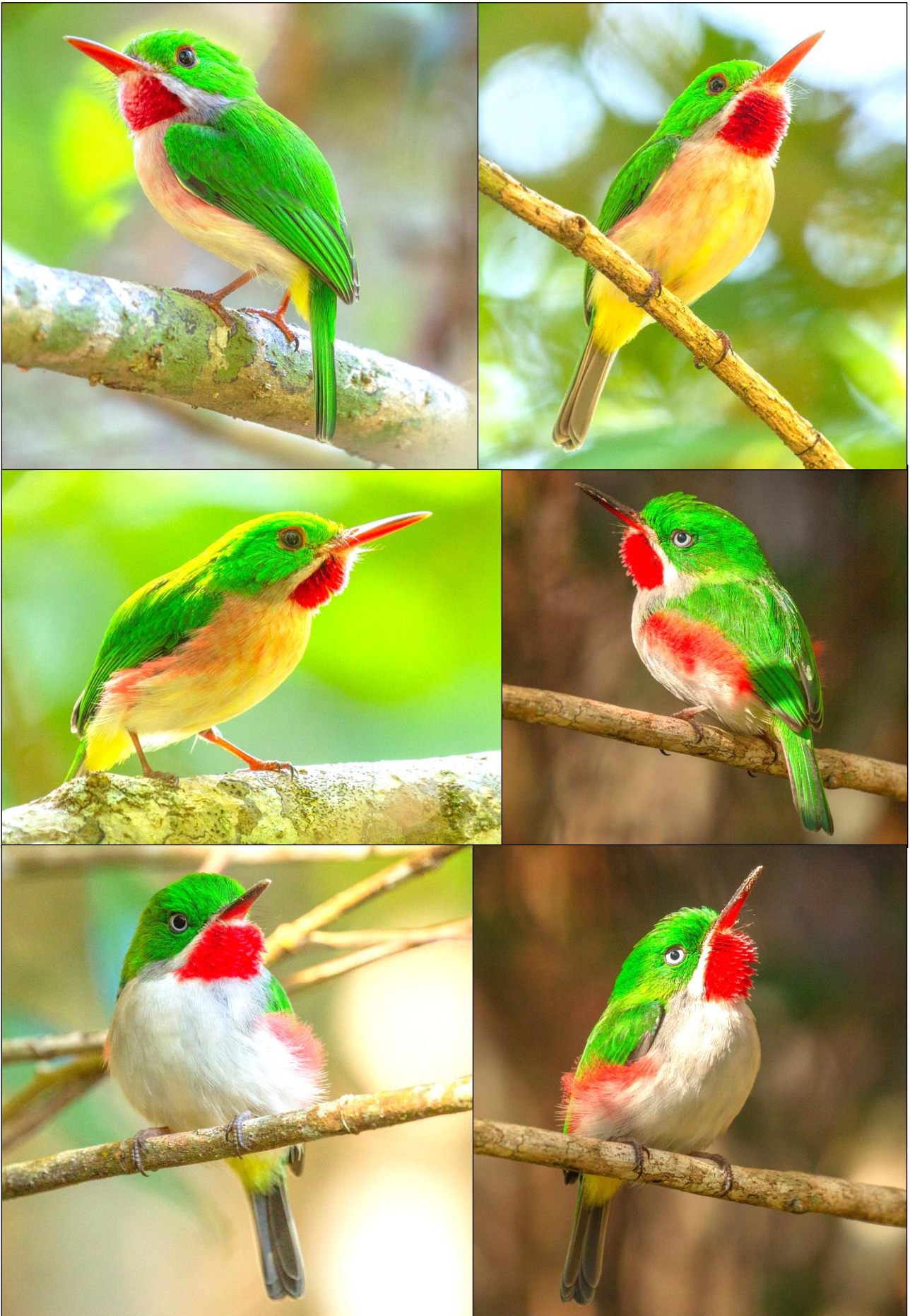
Broad-billed Tody, Rabo de Gato (top & mid-lt.) and Narrow-billed Tody, Loma la Hoz (mid-rt. and bottom)