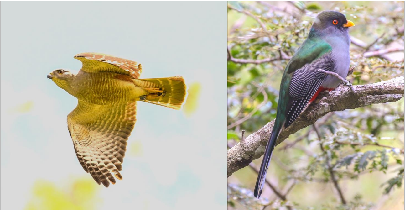
Ridgway's Hawk, Cano Hondo and Hispaniolan Trogon, Loma de Hoz

A surprising double-figure count at Zapoten on the morning of 27/3/22 and a single at Loma la Hoz on 31/03/22.