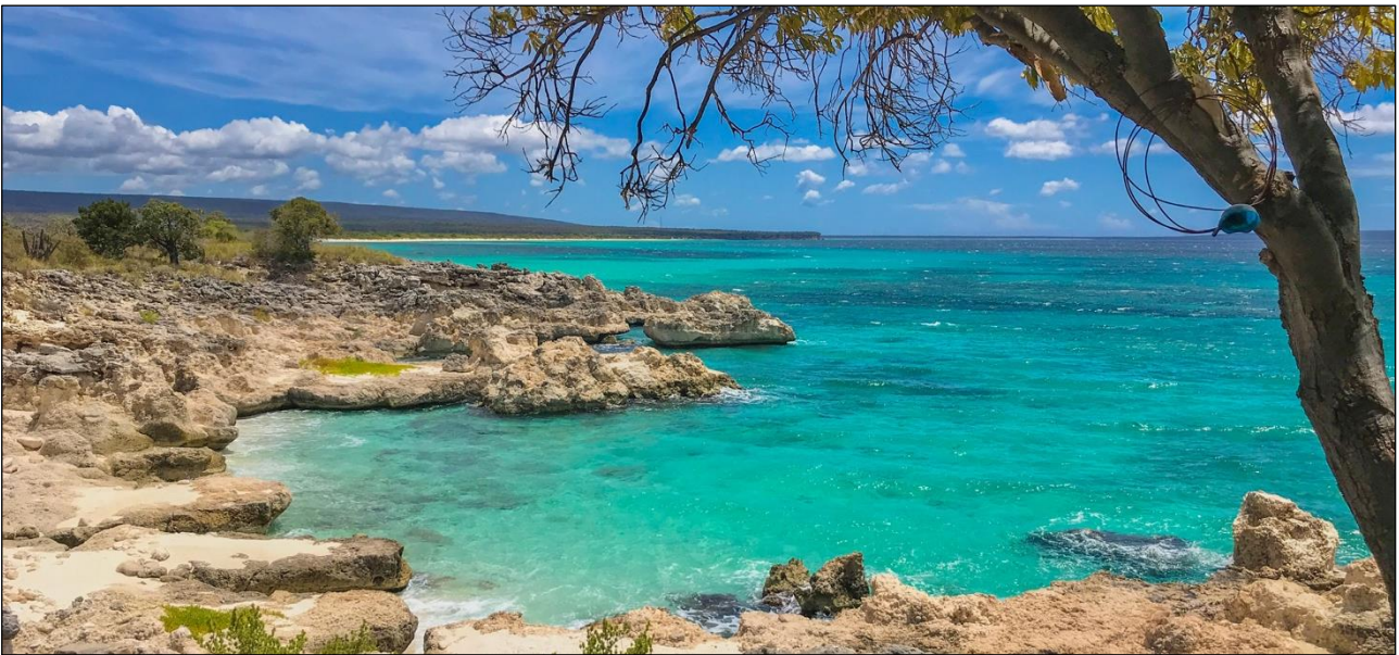
View from Cabo Rojo headland, looking east

In the southwest the most productive birding is found on the wetter north slope of the Sierra de Bahoruco range, between Rabo de Gato and Zapoten, an area which is dominated by deciduous forest. The drier south-facing pine slopes of the Alcoa Road are significantly less species-diverse, but hold a couple of key birds. The predominantly deciduous forest at the eastern end of the dividing range, at Cachote or Loma la Hoz, is noticeably drier than the Zapoten area, but still supports some good birding and at least one key bird.