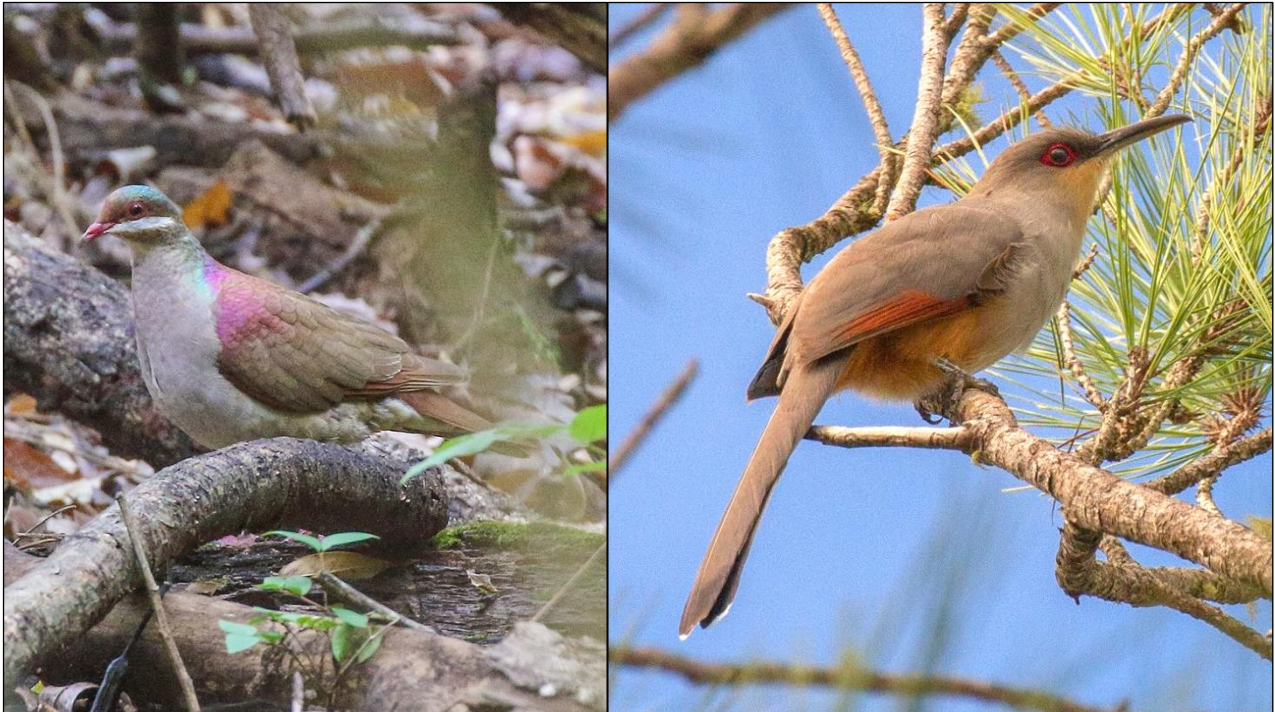
Key West Quail Dove, Rabo de Gato and Hispaniolan Lizard Cuckoo, Alcoa Road

This very attractive dove was seen several times on the Rabo de Gato Trail, with more heard.