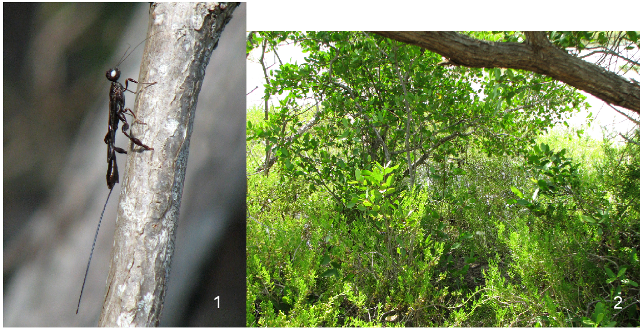
Figures 1-2. Megischus brunneus . 1) Female resting on a mangrove trunk of Laguncularia racemosa at Oviedo Lake, Pedernales. 2) Habitat at Oviedo Lake constituted by salt marsh vegetation and mangroves

Johnson 2003). The distributional records (Fig. 3) show that M. brunneus is present in dry areas of the southwestern Dominican Republic.