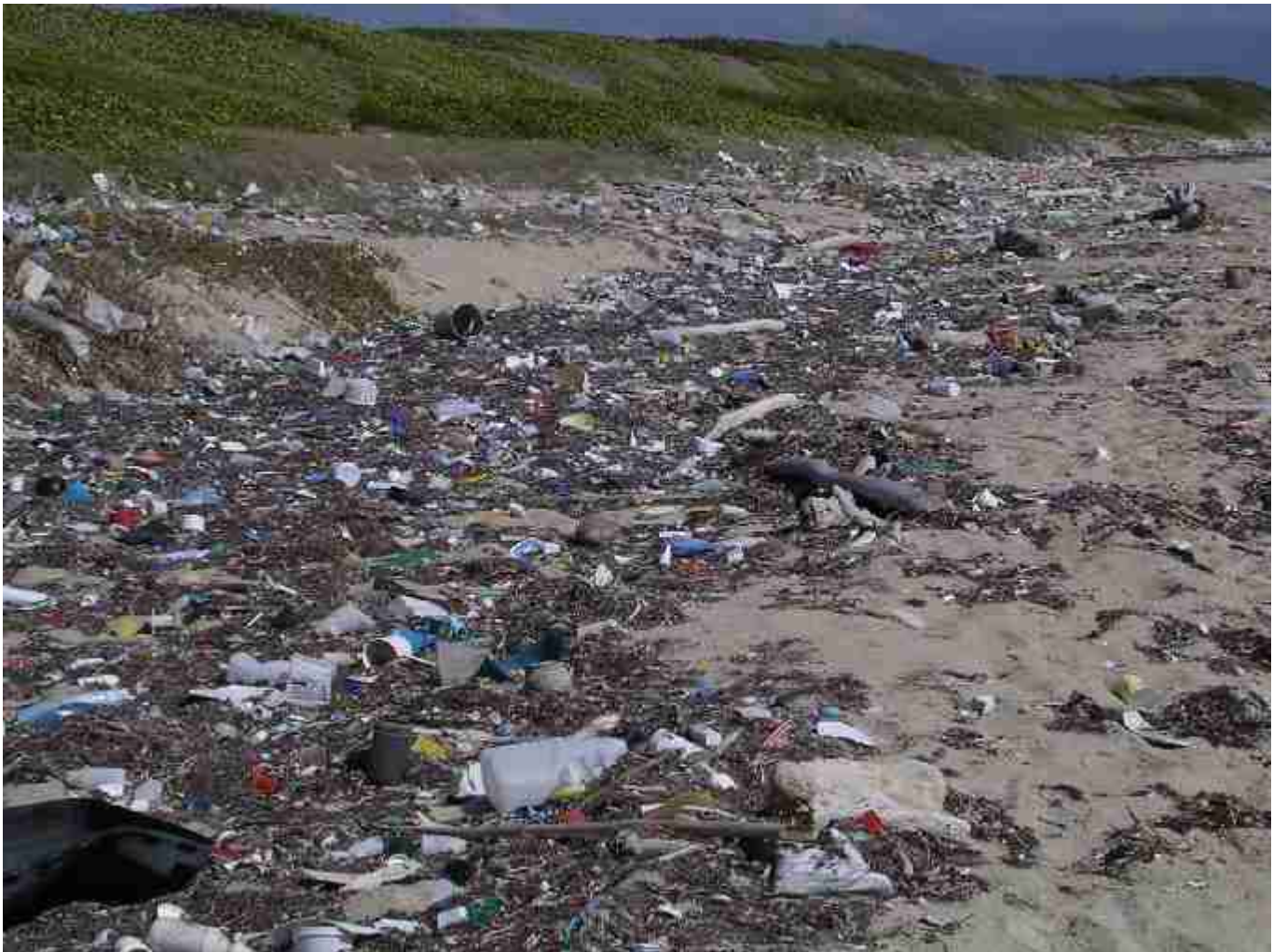
Fig. 2. View of Mosquea beach (east JNP), an important nesting area for leatherbacks.

beaches are low energy with pristine white sand, clean and free of litter. Bahia de las Aguilas, although undeveloped, receives visits from tourists, mostly Dominicans, particularly during weekends and holidays. Eastern beaches are very high energy shores which contributes to the accumulation of massive amounts of plastic and other debris (Fig. 2).