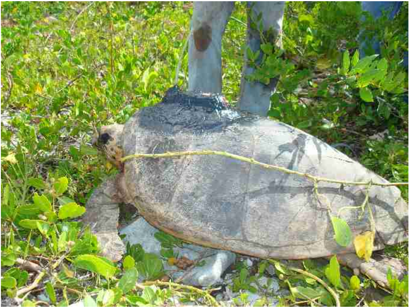
Fig. 3. Hawksbill nesting female tagged with a satellite transmitter in Saona in 2009 by the project team.

Tracks of these turtles can be followed through seaturtle.org at these links: www.seaturtle.org/tracking/?project_id=301 and www.seaturtle.org/tracking/?project_id=291 .