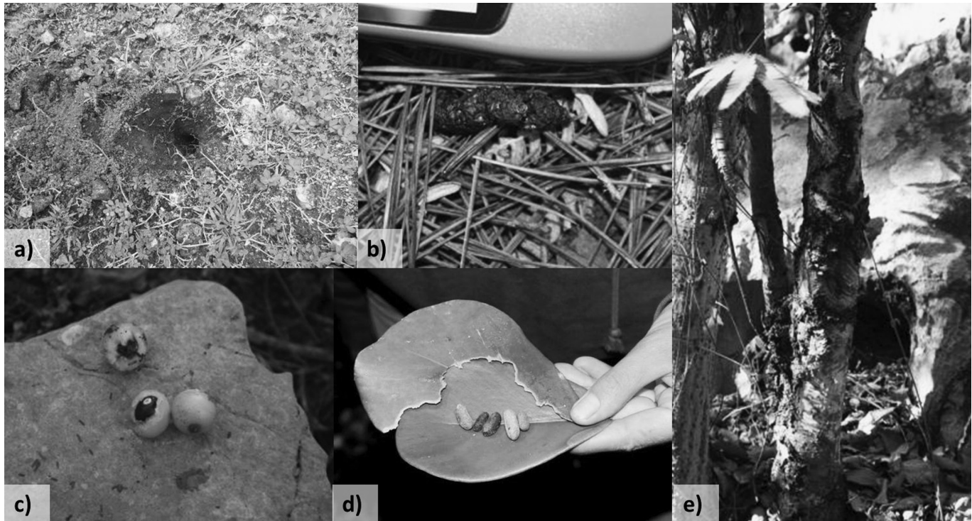
Fig. 2. —Hispaniolan solenodon ( Solenodon paradoxus ) field signs: a) conical-shaped foraging “nose-pokes”; b) feces. Hispaniolan hutia ( Plagiodontia aedium ) field signs: c) gnawed fruit; d) chewed leaf and fecal pellets; e) gnawed bark on tree trunk.

hutia is semiariboreal, and no urine marks were detected during surveys. Indirect signs of any age were used to confirm presence of species within survey plots, as the aim of the study was to understand presence of native mammals in different landscapes rather than fine-scale temporal habitat or resource use. Evidence of non-native mammal species was not recorded systematically.