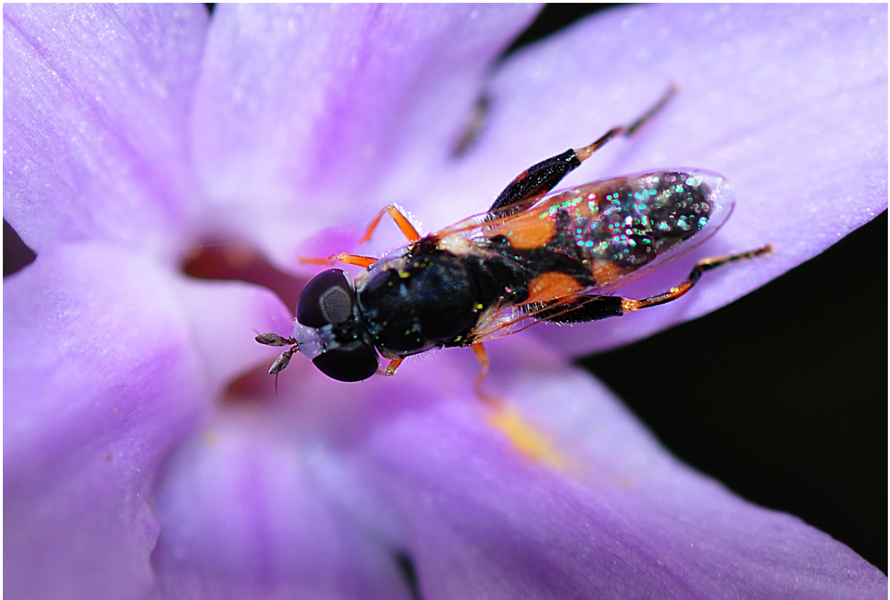
Figure 1. First record of the genus Syritta from West Indies. Female of Syritta flaviventris photographed in Refugio de Vida Silvestre Río Higuamo, the Dominican Republic.

Identification. The most obvious diagnostic characteristic of S. flaviventris is the wing without spurious vein, but the wing venation is not in focus in the photograph (Fig. 1). Another good characteristic that distinguish S. flaviventris from S. pipiens is the hind femur with a basoventral tubercle (large in males, smaller in females; absent in S. pipiens ), but it is also not visible because the picture was taken in dorsal view. Our identification was based on the following morphological characteristics stated by Thompson et al. (1990): face silvery white pruinose, antenna extensively dark, pruinose markings near transverse suture on scutum, fore and mid legs entirely orange, and wing veins orange.