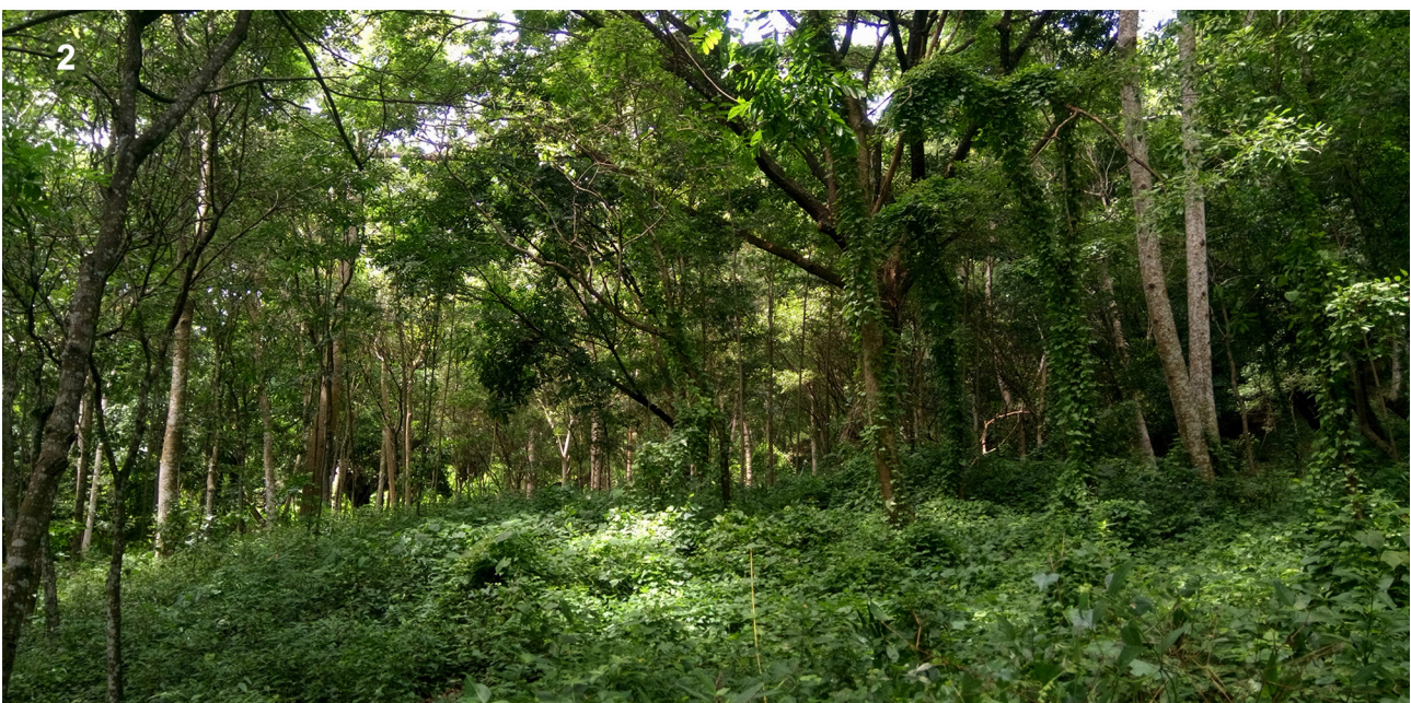
Figs 1–2. Study area: 1 – location of the study area; 2 – wooded area of Parque Ecológico Las Caobas (area with high density of the exotic coral vine)