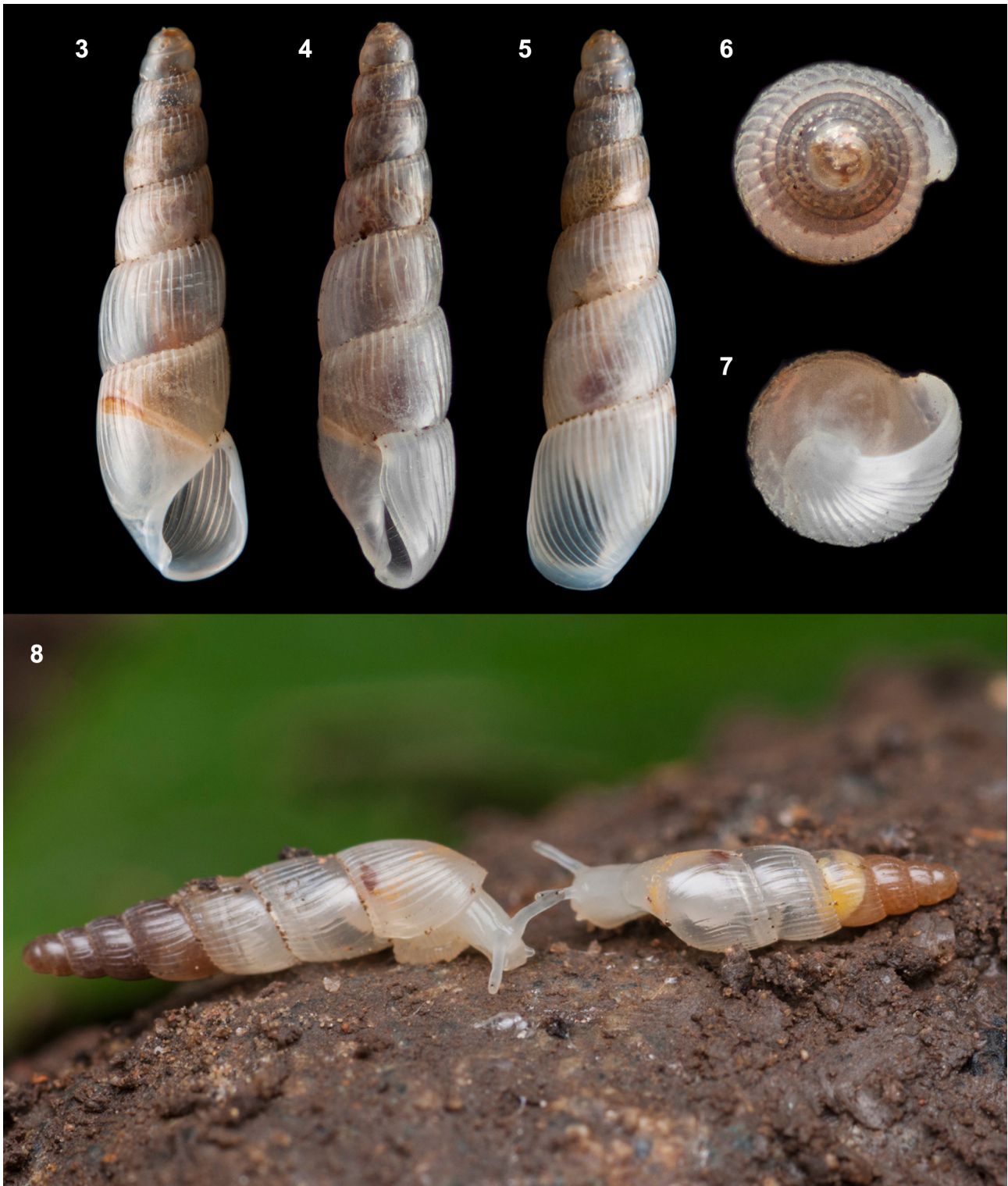
Figs 3–8. Tomostele musaecola : 3 – ventral view; 4 – lateral view; 5 – dorsal view; 6 – apex; 7 – base; 8 – live adult and juvenile individuals

2020). VENEZUELA: four specimens from the FLMNH (UF 383614) collected by Lionel & Miller in 1986 at Gruta De Lourdes, San Sebastián, Aragua State (9°57.36'N, 67°10.82'W) (PAULAY & BROWN 2020).