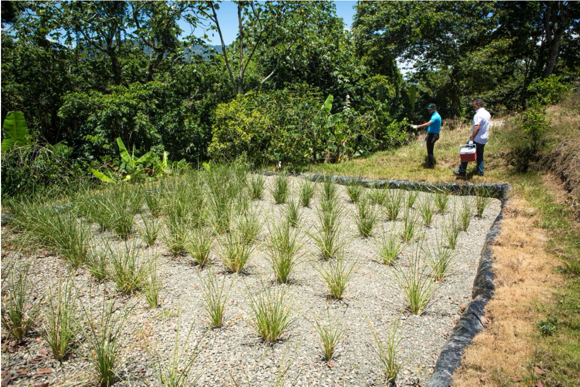
Figure 1: Constructed wetland in the Dominican Republic.